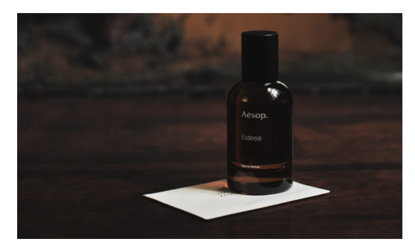
Aesop launches "Eidesis Eau de Parfum", new fragrance inspired by woods, warmth, and wonder