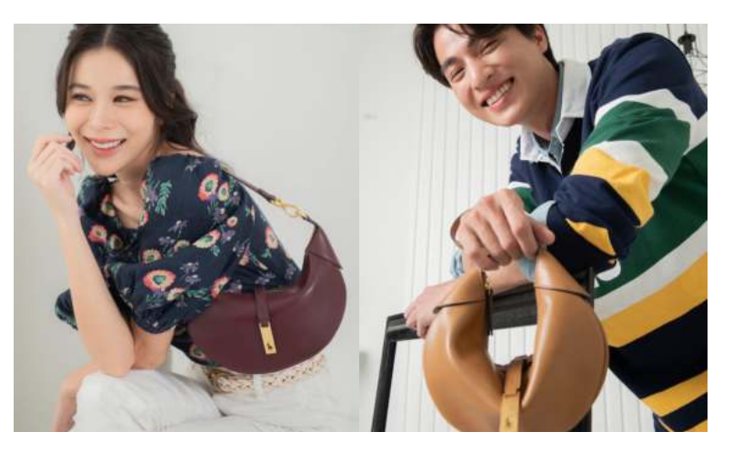
Ralph Lauren introduces Polo ID collection inspired by the sense of adventure, romance, and optimism