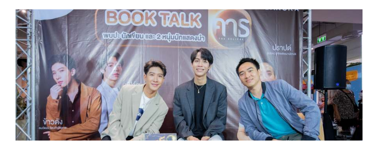
B2S CLUB Exclusive Book Talk "The Eclipse" @ B2S Think Space Bangna