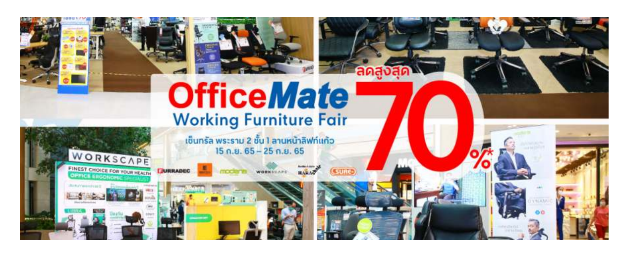
OfficeMate offers up to 70% discount on famous brand furniture at OfficeMate Working Furniture Fair, Central Rama 2