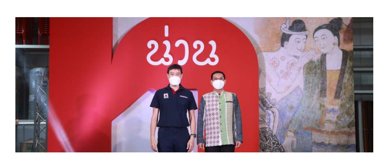
Thai Watsadu introduces the 63<sup>rd</sup> branch in Nan province to cater to growing demands for construction materials in the Upper Northern region