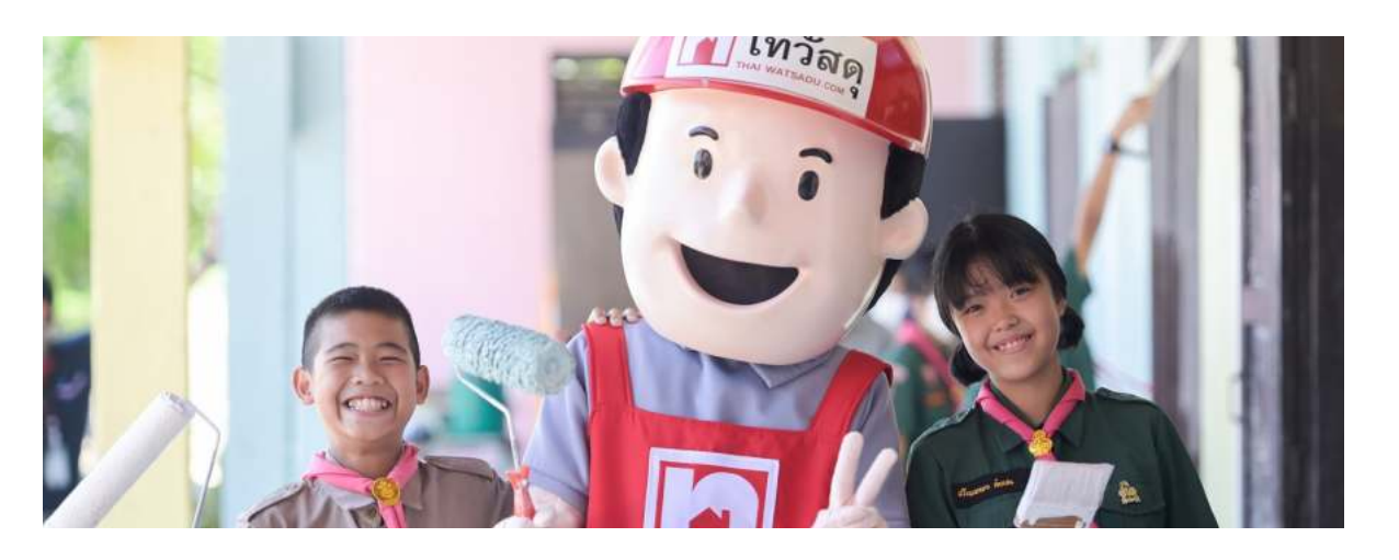
Thai Watsadu continues their CSR mission to help flood victims in Nan province and support businesses with sustainable values