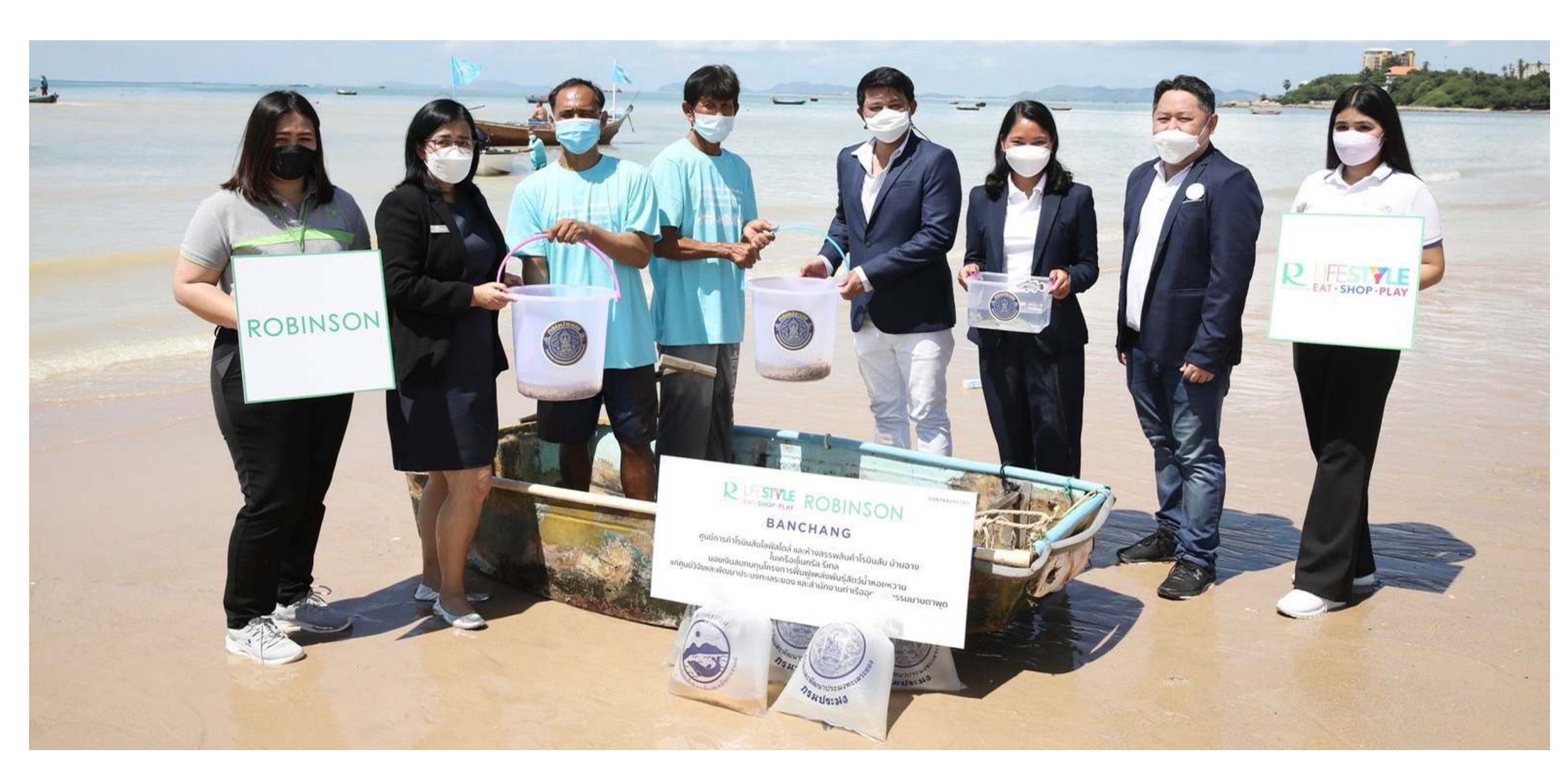
Robinson Lifestyle and Robinson Ban Chang together launch the project "Restoring Spotted Babylon Snails" in the Coastal Area of Rayong province with community engagement