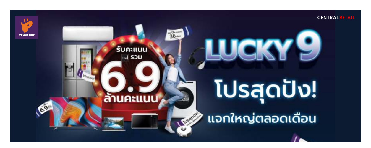
Power Buy organizes the best promotion of the year "Lucky 9" with big giveaway up to 6.9 million points and great discounts