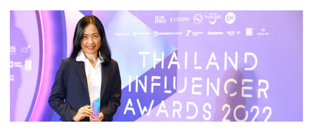
OfficeMate Plus+ awarded "3rd Prize Winner" for Best Retail Store & Shopping Mall Influencer Campaign from Thailand Influencer Awards 2022