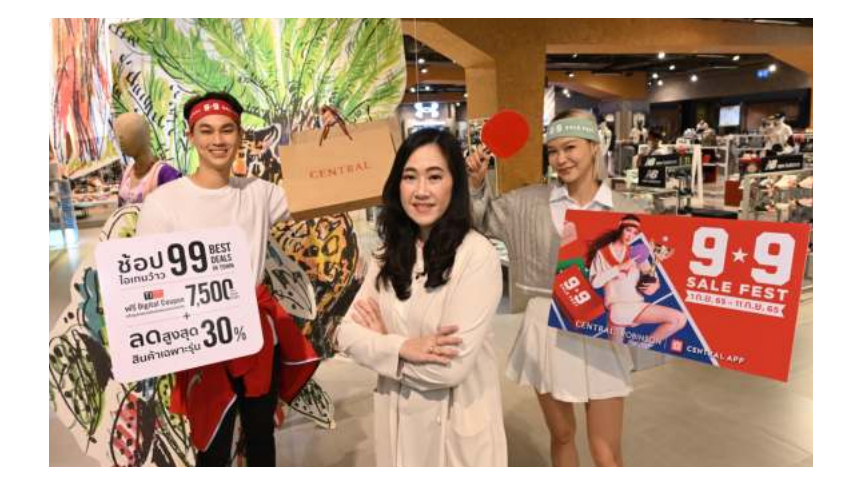
Central, Robinson and Central App form synergy to drive double-digit sale with "9.9 Sale Fest" campaign