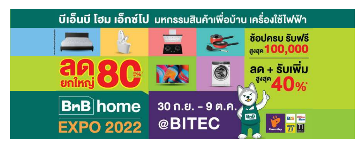
Don't miss out! Get ready for Home and Electrical Fair "BnB home EXPO 2022" with big discount up to 80%!