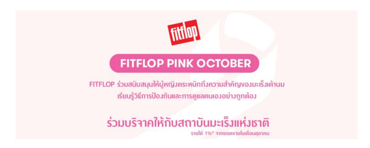
FitFlop launches campaign "FitFlop Pink October" to fight against breast cancer for all woman in Thailand