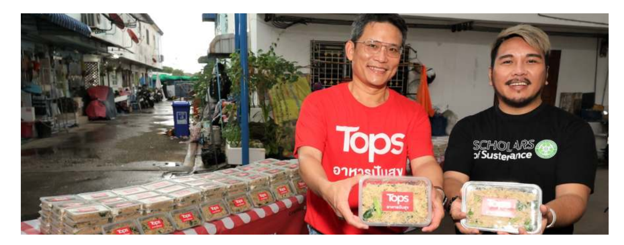
Tops continues its mission of creating sustainability and aims to reduce food waste to zero