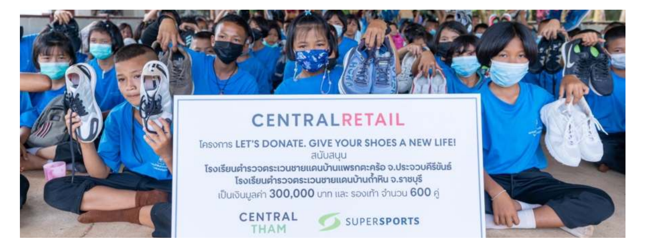
Supersports would like to thank everyone who took part in donating money or shoes to support our "LET'S DONATE. GIVE YOUR SHOES A NEW LIFE!" campaign