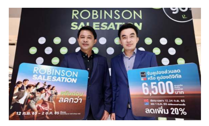
Robinson brings back their signature campaign of the year "ROBINSON SALESATION" with up to 90% discount stickers & more