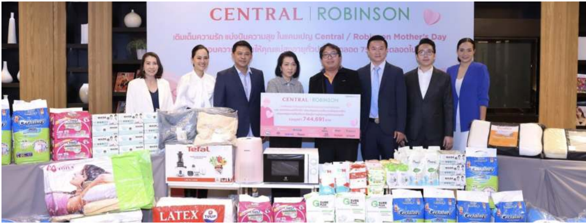
Central and Robinson join forces with partners and shoppers in donations for elderly mums in the River of Peace Foundation