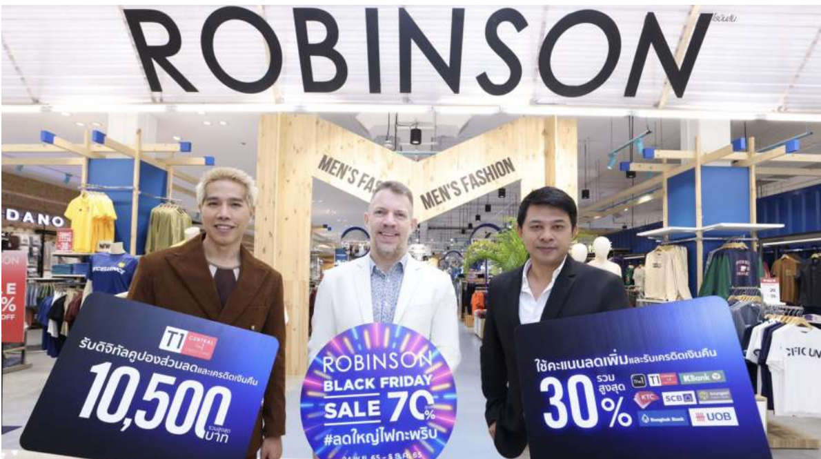
Robinson Department Store brings back campaign of the year “ROBINSON BLACK FRIDAY” to boost year-end spending