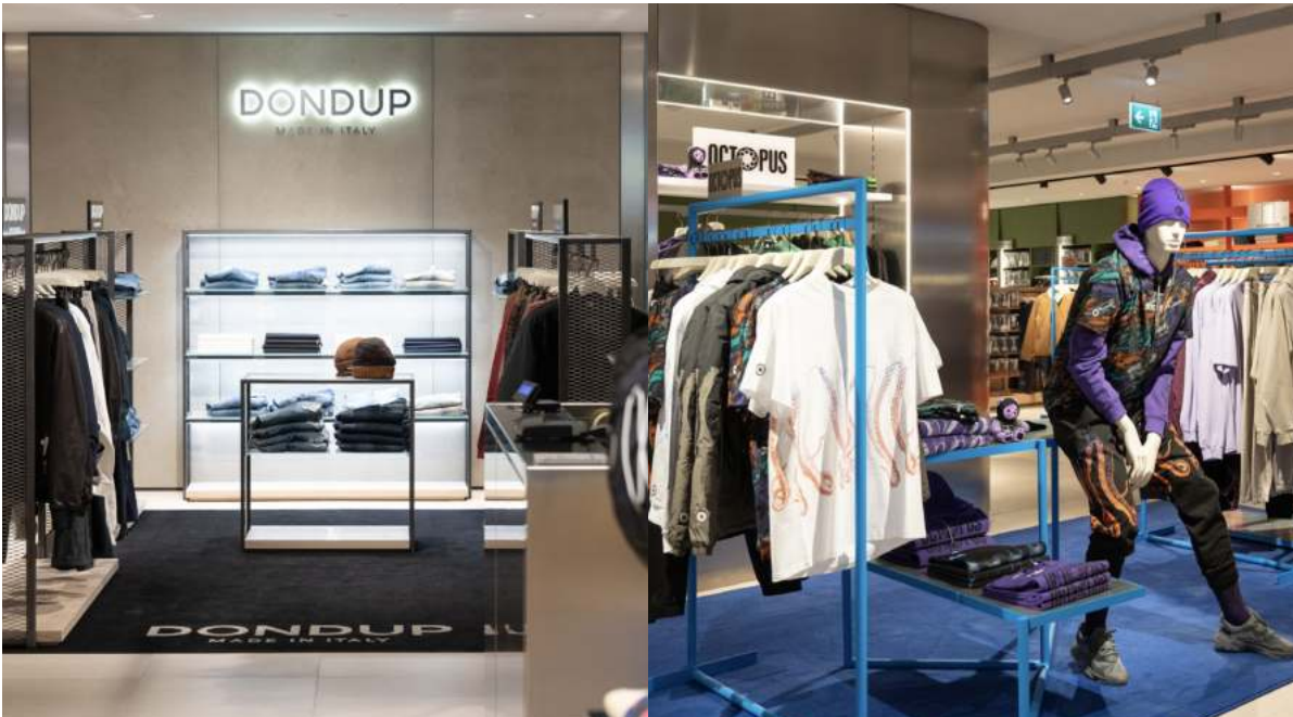
Rinascente unveiled the 1 st floor of Rinascente Rome Piazza Fiume, dedicated to the men's collection, after the renovation of the entire store