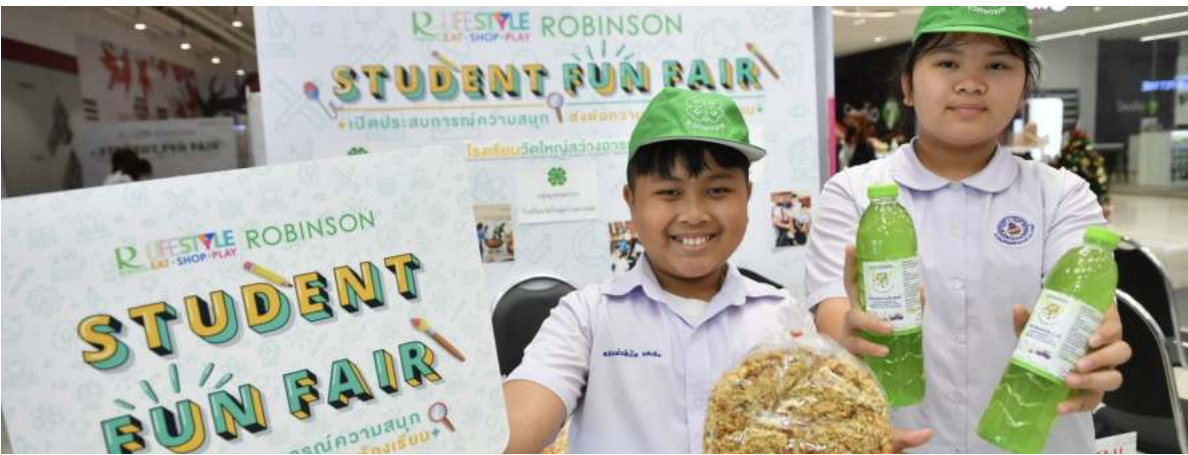
Robinson Lifestyle and Robinson Department Store reinforce their presence as community hub with “STUDENT FUN FAIR” activity