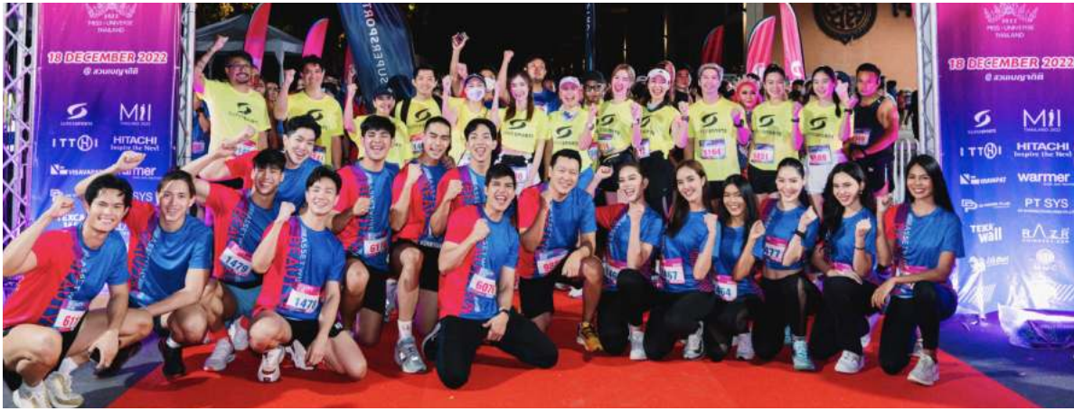
Supersports take the runners to join event “AssetWise BEAUTY RUN 2022” the charity event for the National Cancer Institute