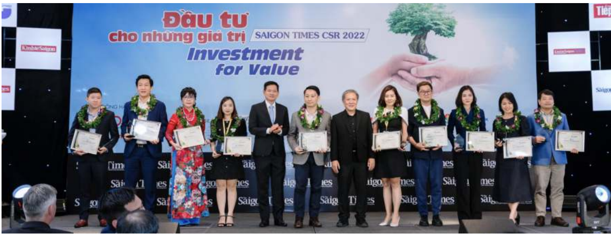
Central Retail Vietnam received The CSR 2022 Certificate of Recognition from the Saigon Times