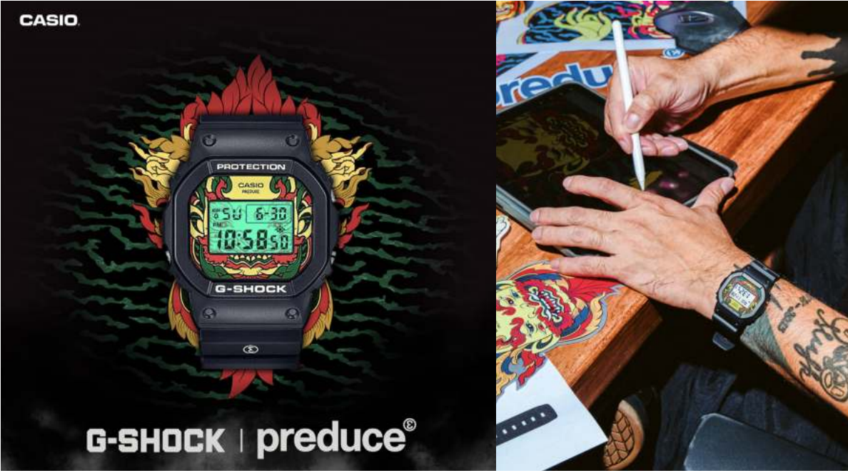
CASIO G-SHOCK paid homage to Thailand with its collaboration piece with Prepuce Skateboards, designing The Thai Guardian Giants