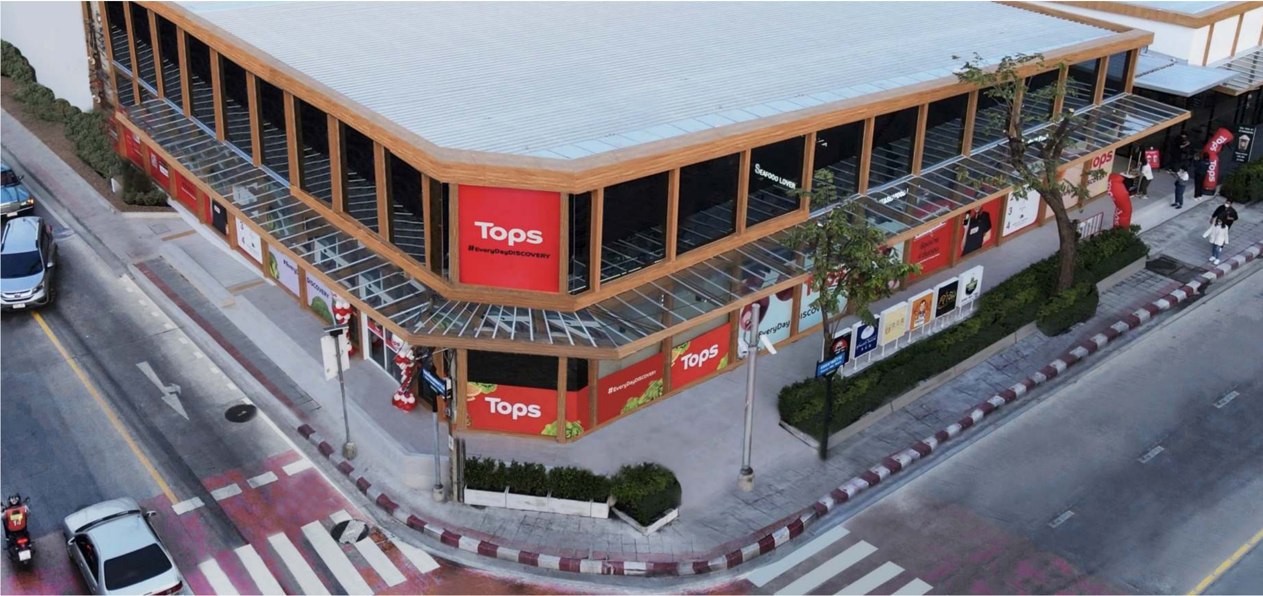
Tops leads food retail by launching 5 stores in December 2022, highlighting Nak Niwat Ladprao standalone store with the concept of Urban Space