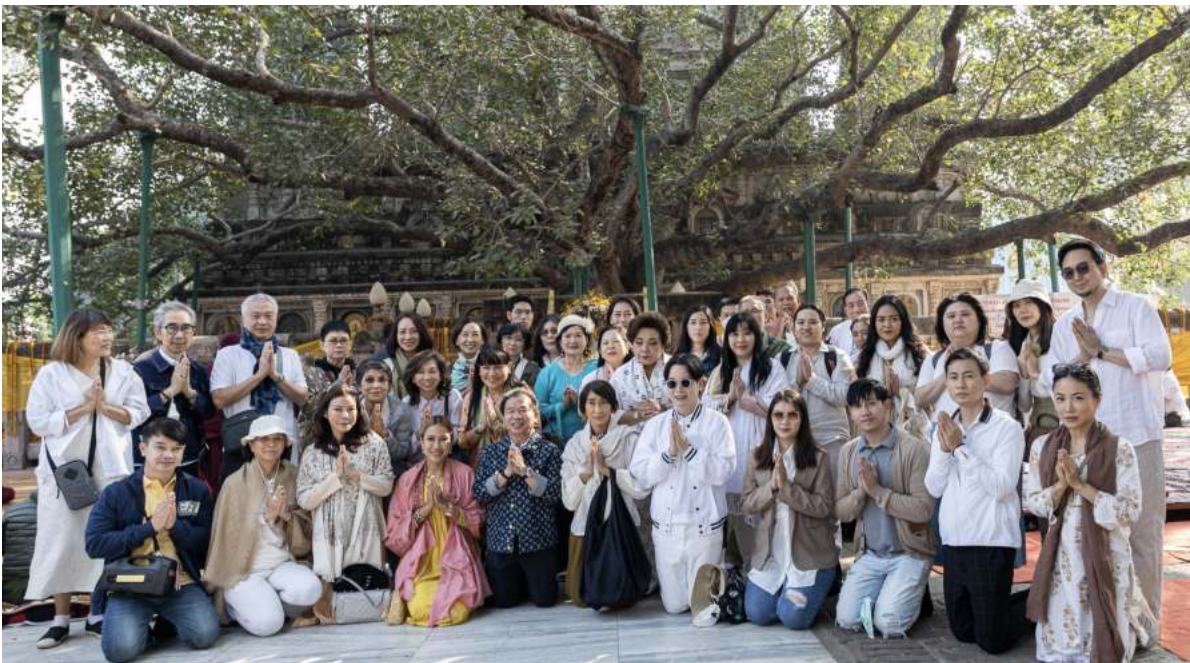
Central Department Store takes VVIP customers on an exclusive trip to Bodh Gaya, India in celebration of the store’s 75 th Anniversary