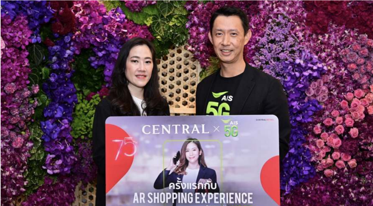
Central Department Store joined forces with “AIS 5G” to launch “AR Shopping Experience,” Thailand’s First AR Personal Shopper