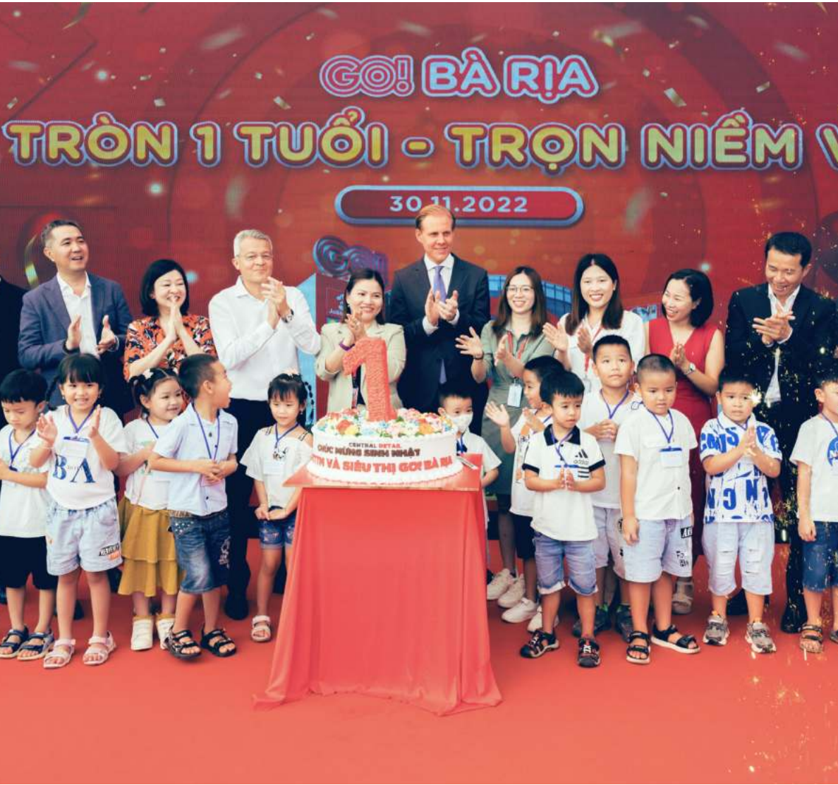
Central Retail Vietnam celebrated the first anniversary of GO! Ba Ria