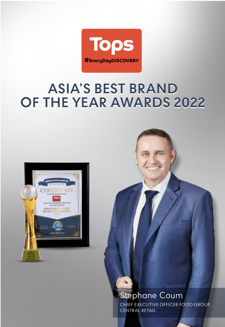
Tops won a major international award, Asia's Best Brand of the Year Awards 2022, highlighting its position as the #1 food retailer in a Thailand