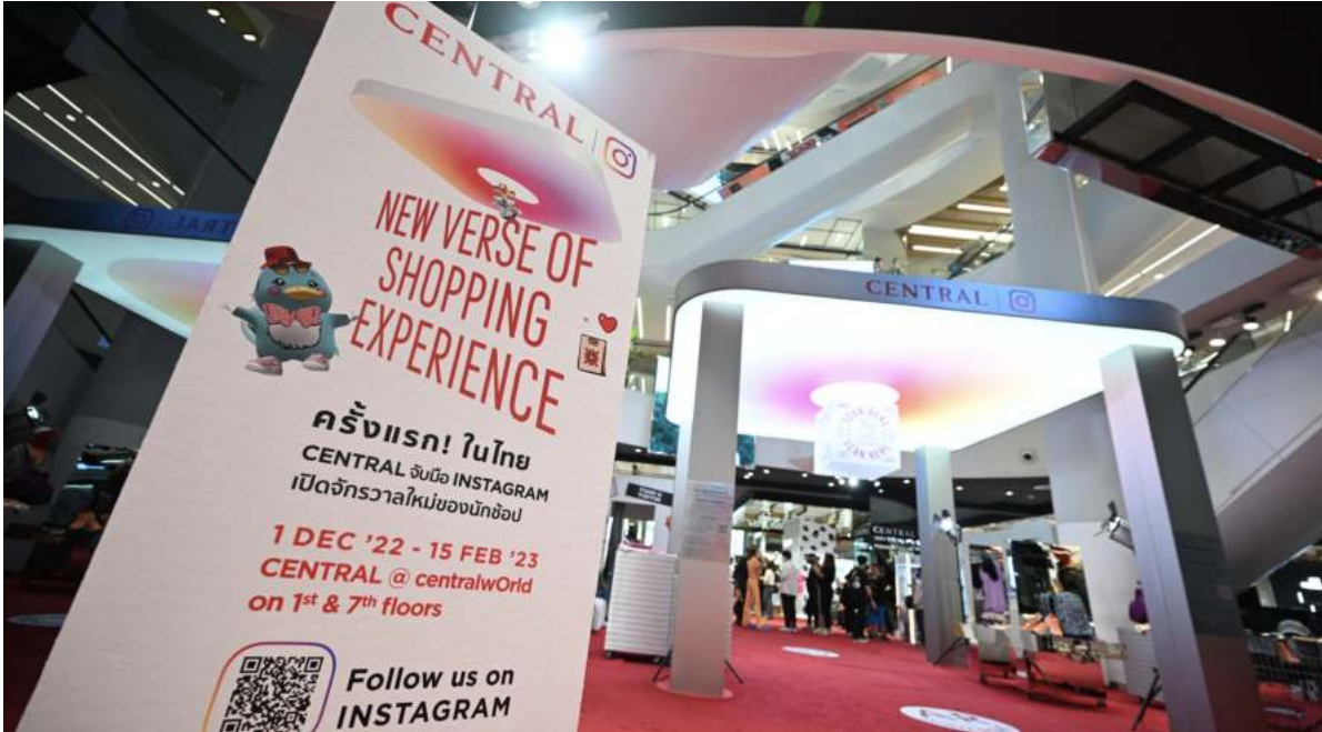
Central Department Store teamed up with Instagram, bringing the digital presence to the physical world with the first-ever “Instagrammable Store”