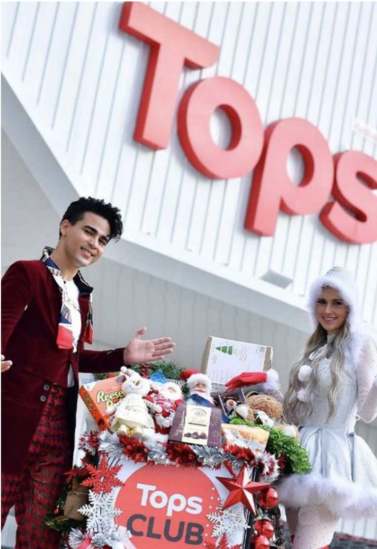
Tops CLUB invites you to explore over 1,000 festive items exclusively imported to welcome the festive season