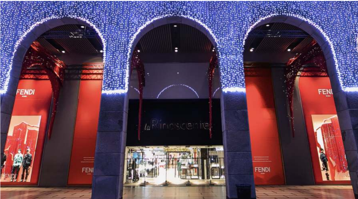
Rinascente together with 4 top luxury fashion brands, transformed 4 Rinascente stores in celebration of Christmas and the New Year