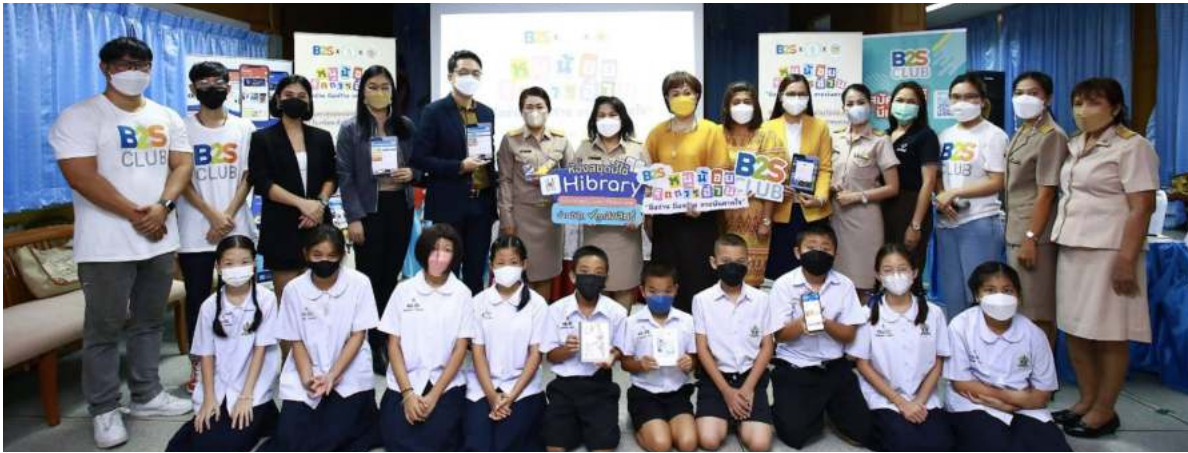
B2S CLUB Shool Road Show: Spreading happiness with various reading, writing, learning and entertainment activities throughout December