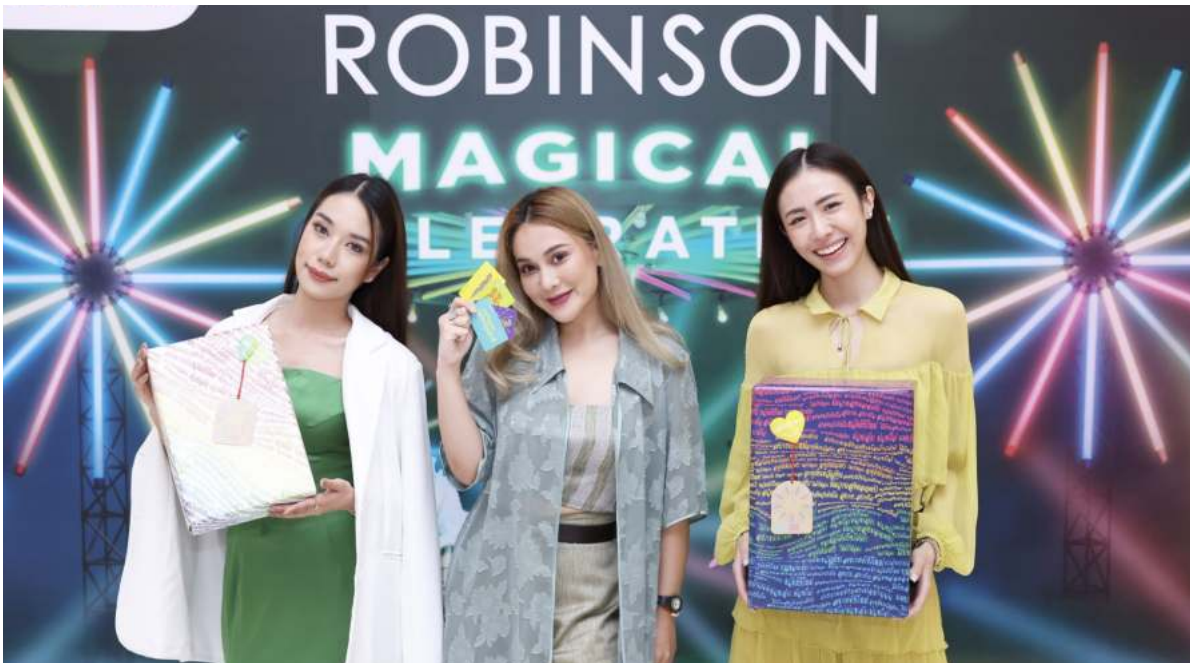
Robinson Department Store to share gift shopping tips in “ROBINSON MAGICAL CELEBRATION 2023”