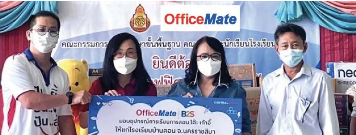
OfficeMate took collective effort to refurbish school building after the flood recedes, donating school supplies to Ban Don School, Nakhon Ratchasima Province