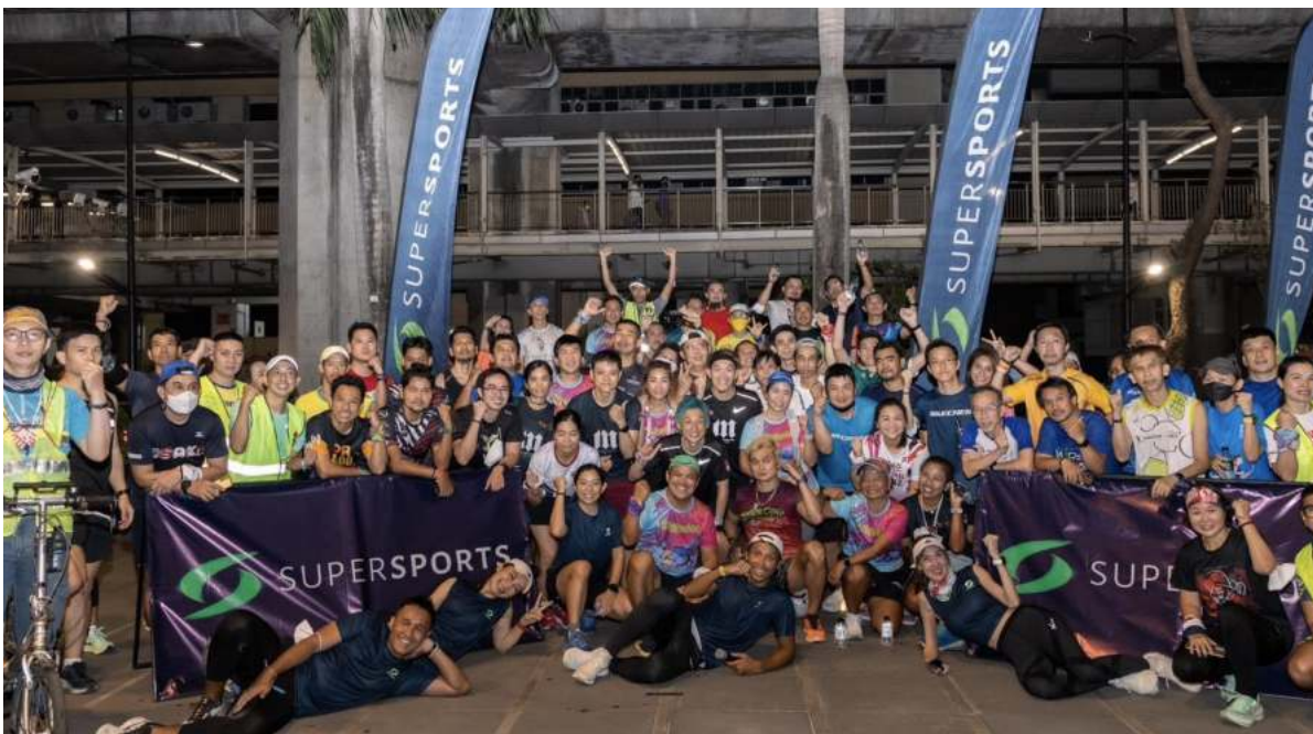
“Running Camp” J MART GROUP PRESENTS JM RUNNING CLUB X AILC RUNNING CLUB X SUPERSPORTS