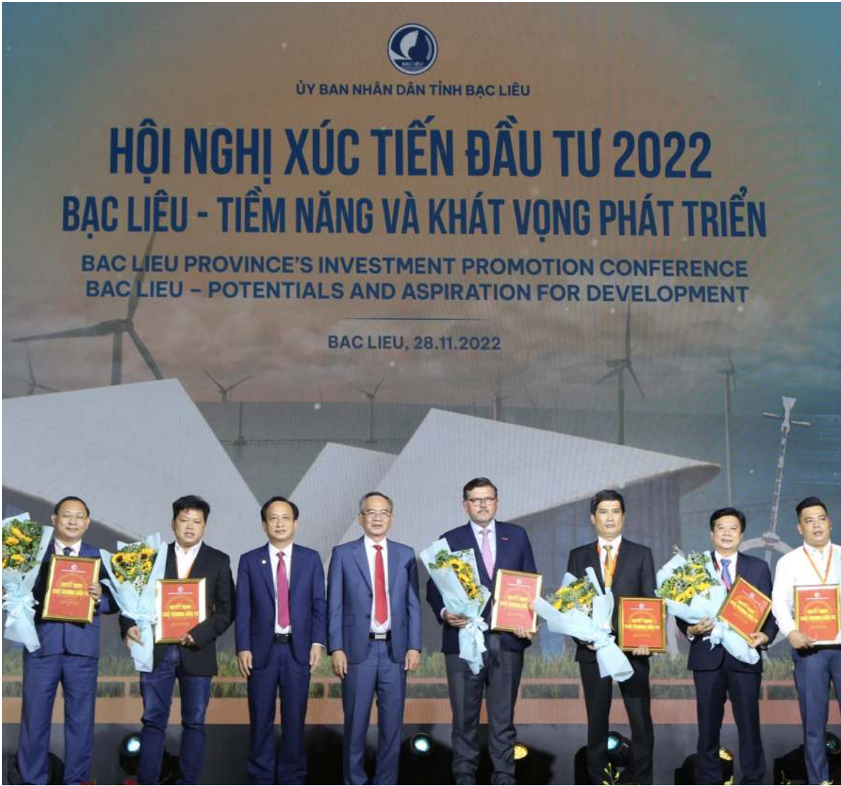
Centrail Retail Vietnam attended the Bac Lieu Investment Promotion Conference 2022 and received the Investment Registration Certificate for GO! Mall in Bac Lieu