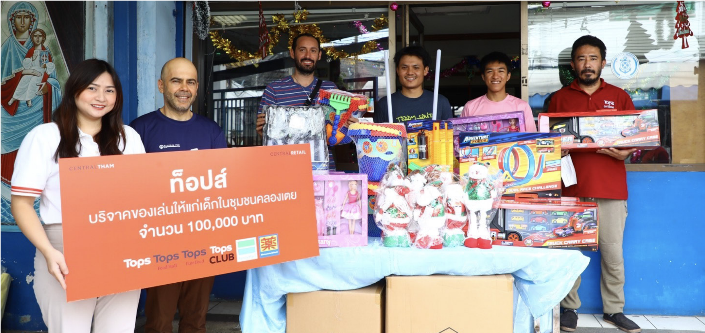
Tops CLUB spreads joy in the festive season by offering toys with value over 100,000 Baht to children in the Khlong Toei community