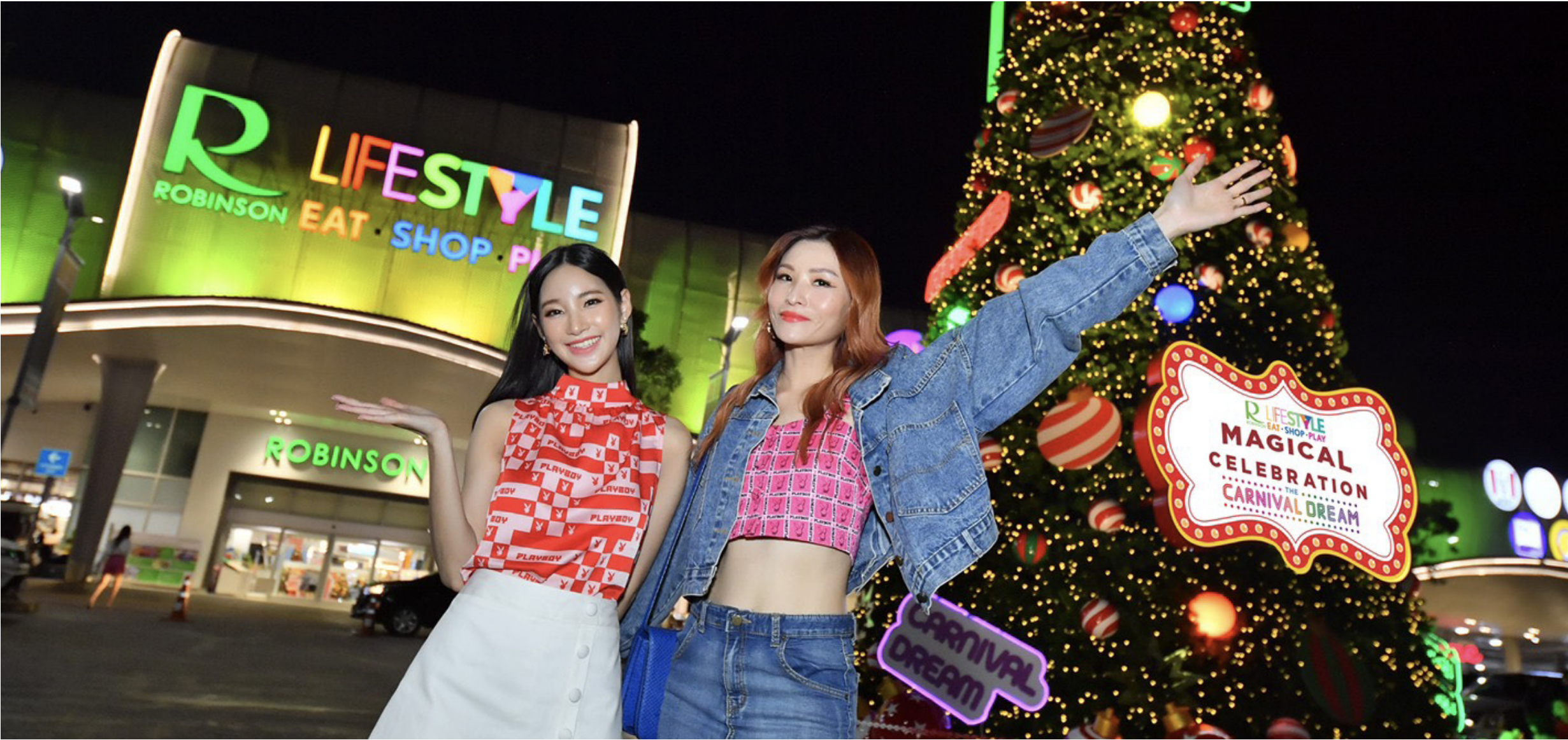
Robinson Lifestyle teamed up with 2 celebs to unveil “THE BEST DESTINATION OF EAT-SHOP-PLAY” in “ROBINSON LIFESTYLE MAGICAL CELEBRATION 2023”