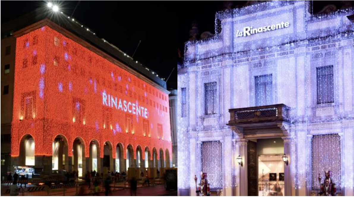
Rinascente celebrates the joyous Christmas and New Year moments through dazzling light decoration across nation-wide department stores