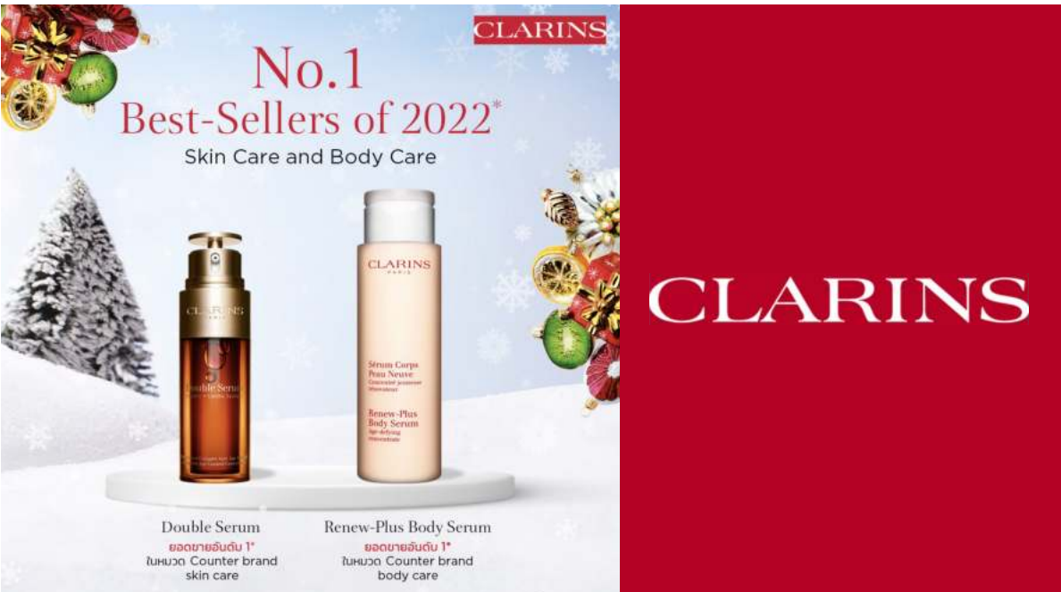
Clarins now rules as No.1 Best-sellers of 2022 Skin Care and Body Care in Thai market