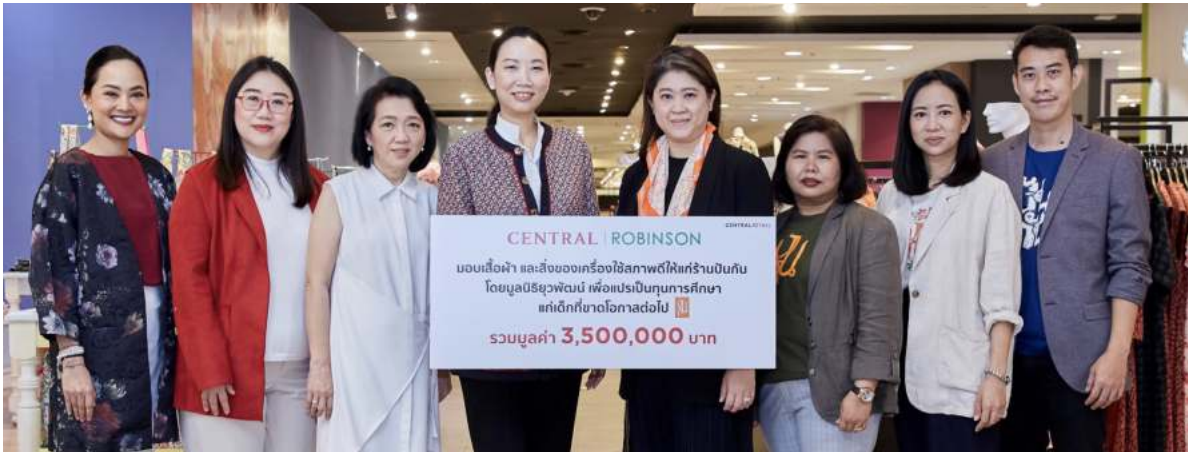
Central and Robinson Department Store share the love with their donations worth 3.5M Baht to Pankan Shop by Yuvabadhana Foundation