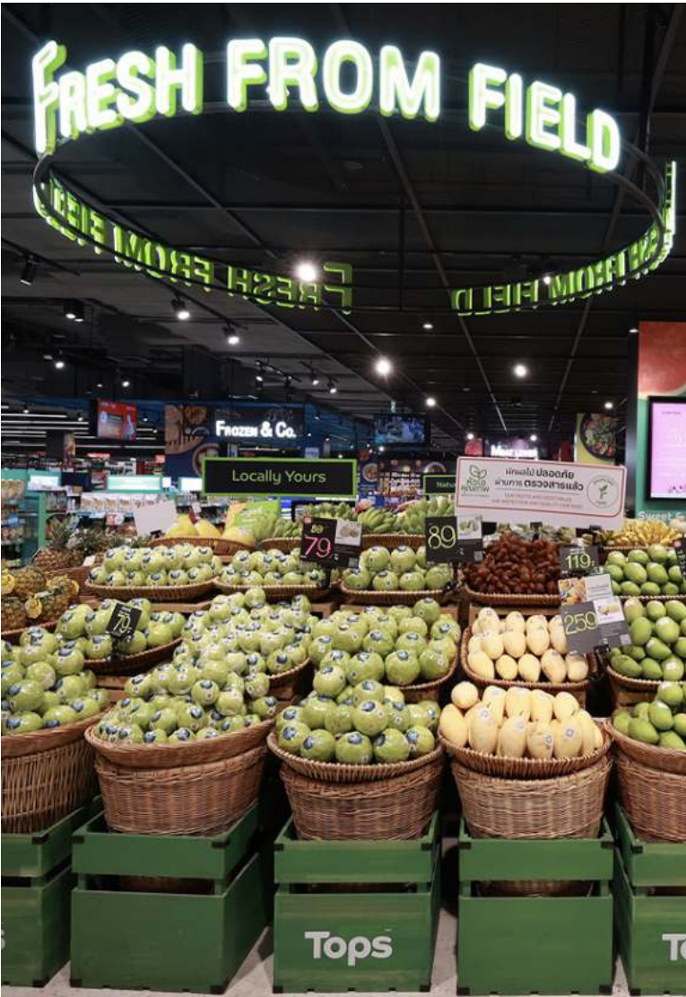
Tops spearheads Room Concept to capture shoppers' attention and offer the best experience following the concept of "Every Day Discovery"