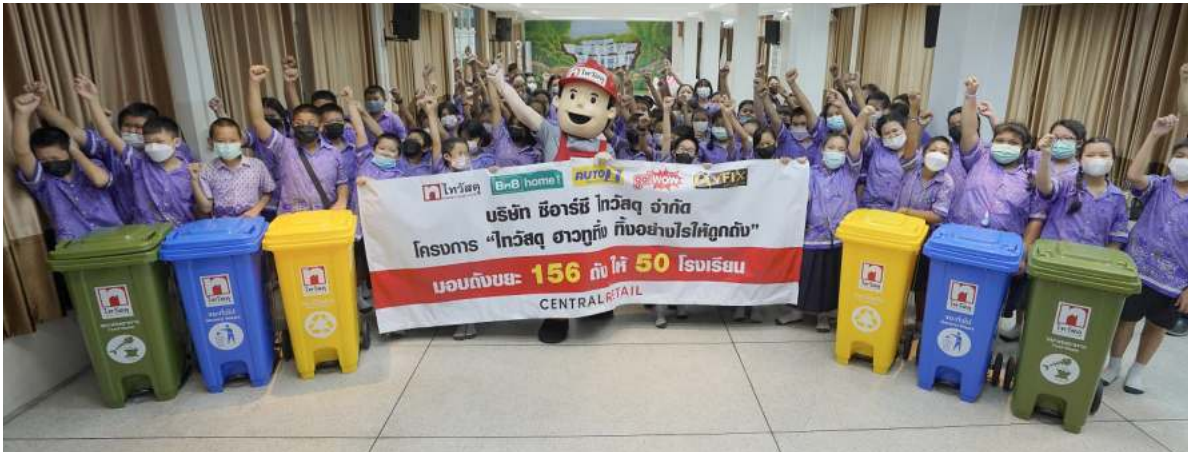
Thai Watsadu visited 2 schools to educate children about waste segregation as part of the campaign “Thai Watsadu, how to dispose to the right bin”