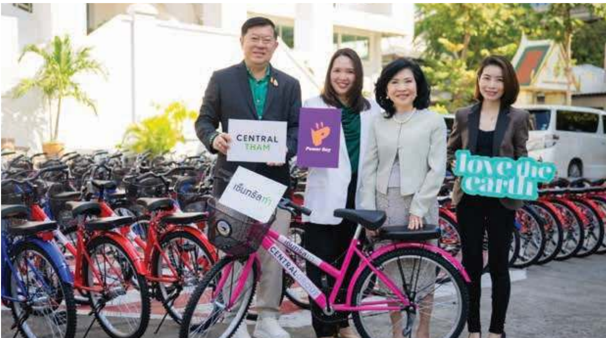
Central Group and Power Buy donated 200 bicycles to students at two border patrol police schools in the North