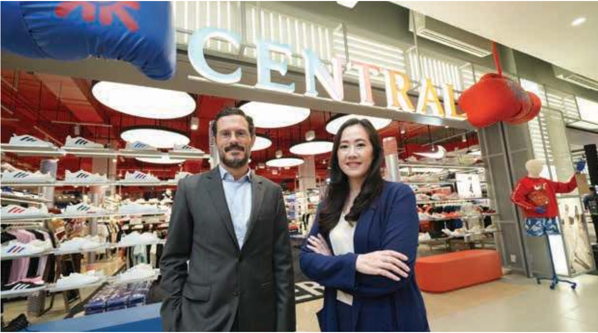
Central unveils the fresh new look of “Central Ramindra” a new shopping arena, with boxing stadium decorative elements