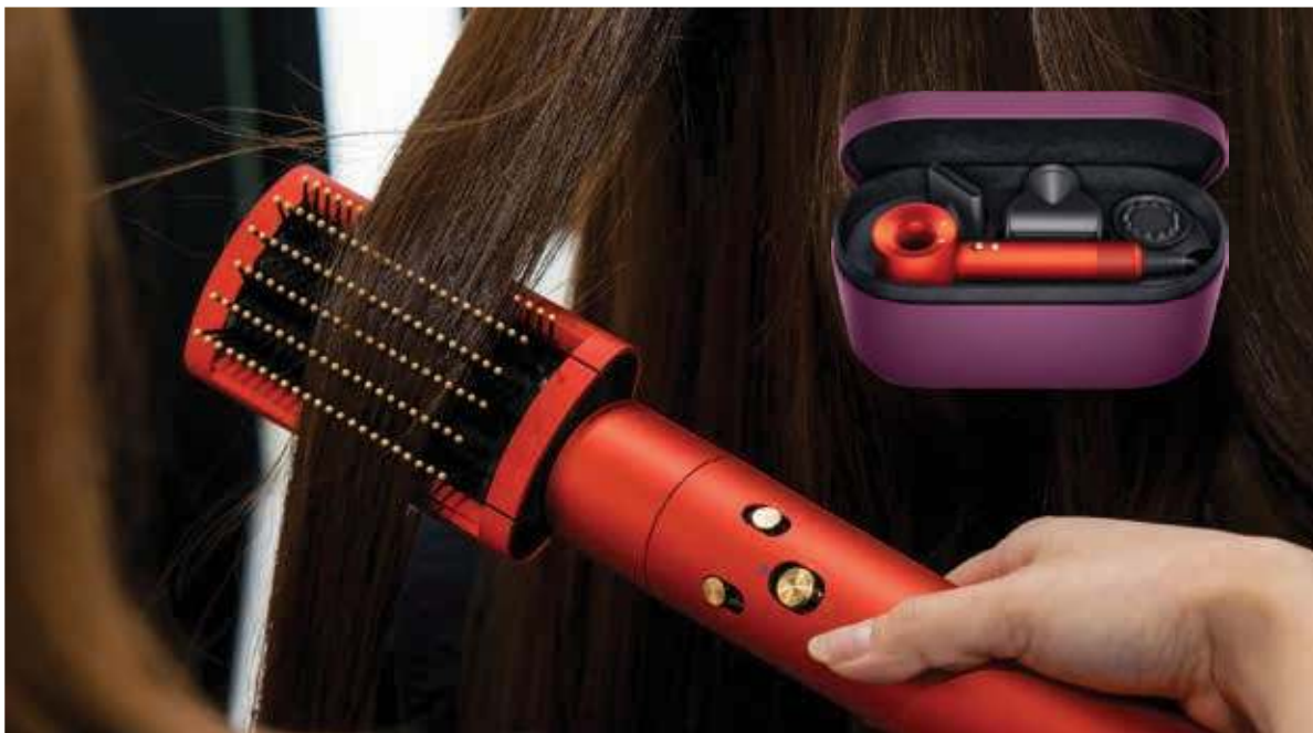
Dyson unveils special-edition “Topaz Orange” colourway in celebration of Lunar New Year and Valentine’s Day