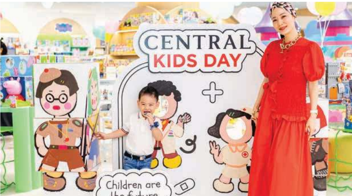
Central and Robinson invite you to participate in the campaign “Central / Robinson Kids Day”