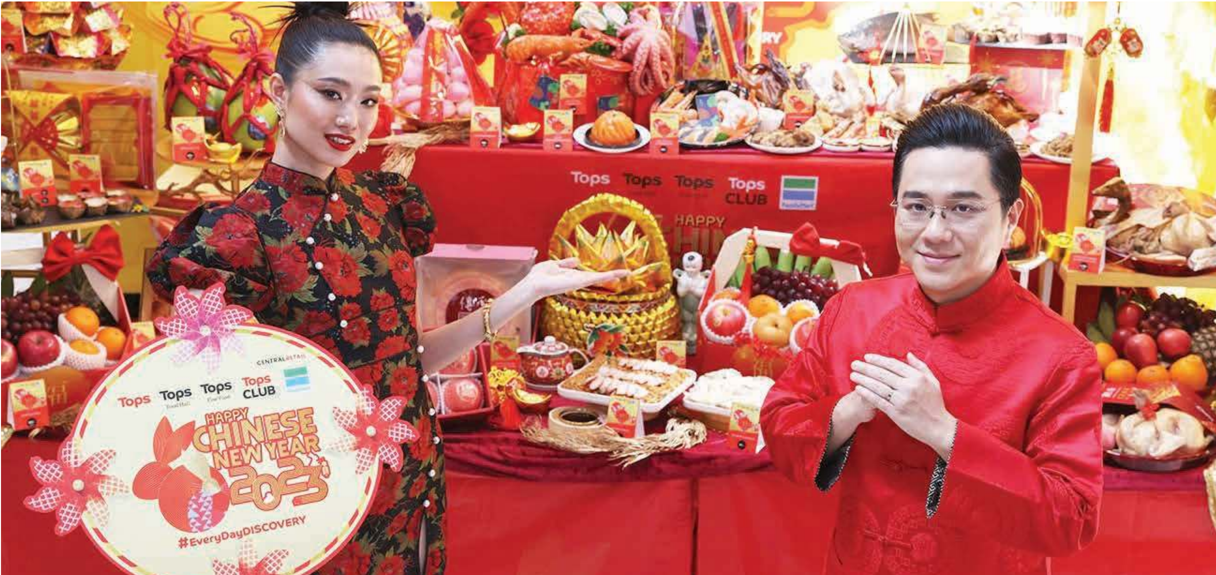
Tops celebrates Chinese New Year with auspicious offering sets to summon good luck for the Year of the Rabbit