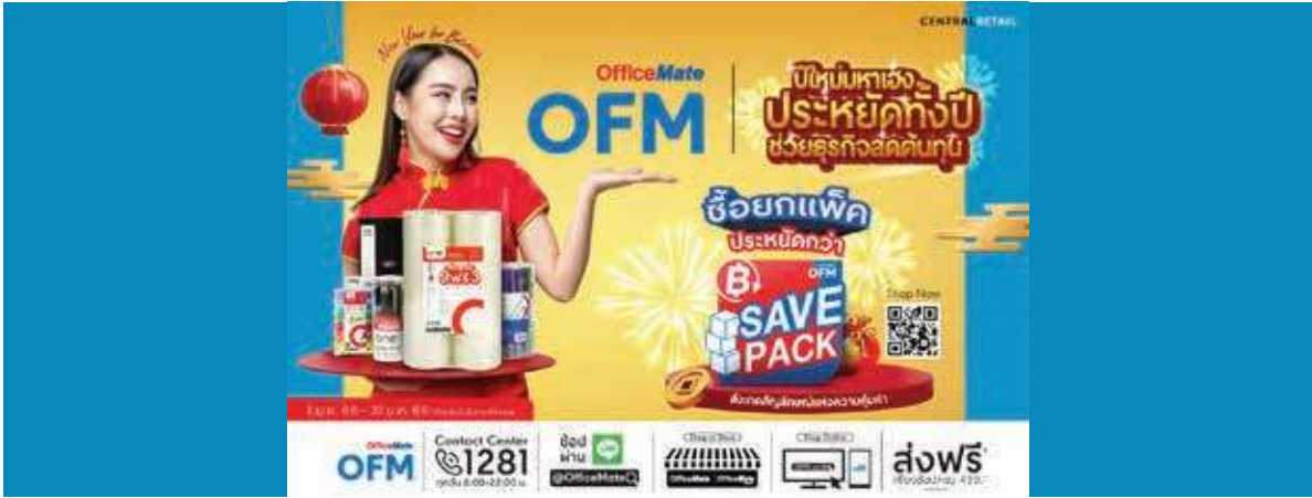
OfficeMate helps businesses reduce costs with “Save Pack” campaign