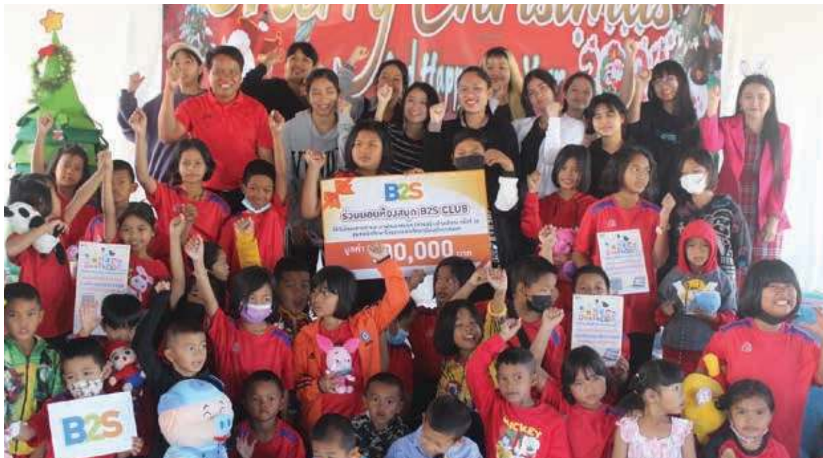
B2S donated B2S CLUB E-library to students volunteer camp project at Ban Hin Kong School, Chaiyaphum, Thammasat University