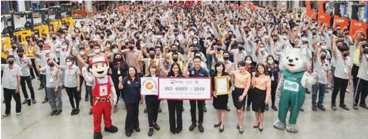
Thai Watsadu's Wang Noi Distribution Center received the ISO 45001 safety standard, highlighting its leadership position as a building materials retailer