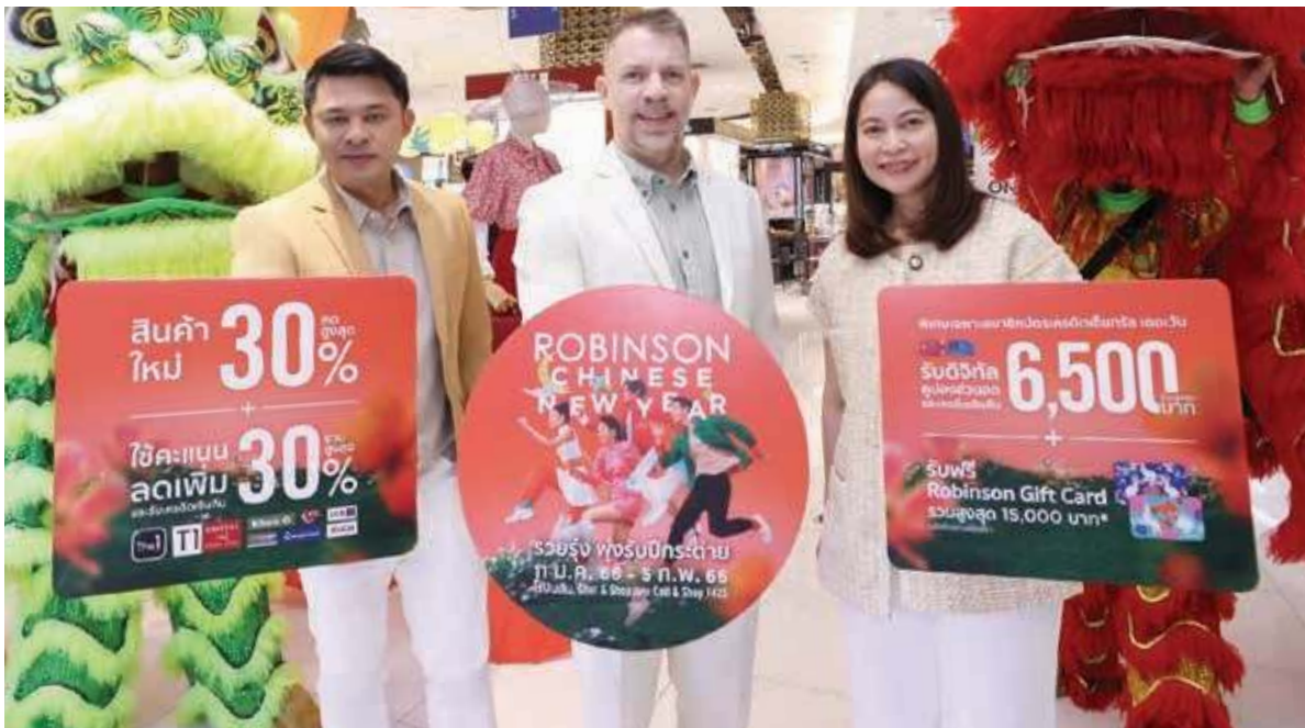
Robinson and Robinson Lifestyle welcome the Year of the Rabbit with “ROBINSON LIFESTYLE & ROBINSON CHINESE NEW YEAR 2023”