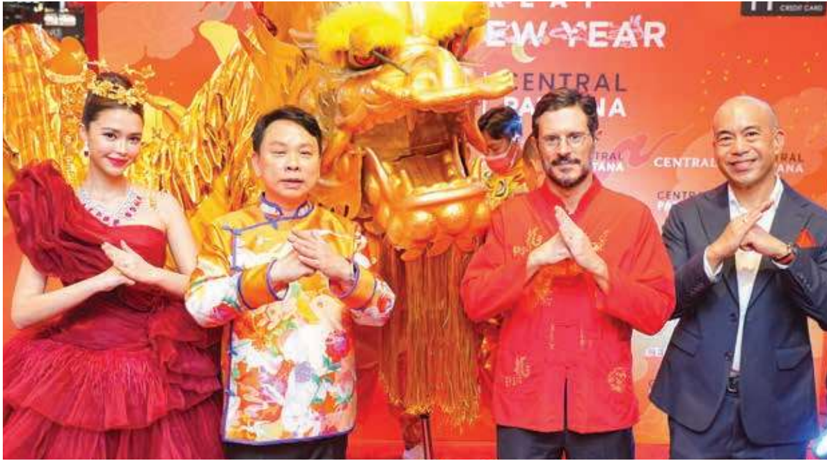
Central launched “The Great Chinese new year 2023” in collaboration with acclaimed artist “JCCHR” to create “Lucky Rabbit” design