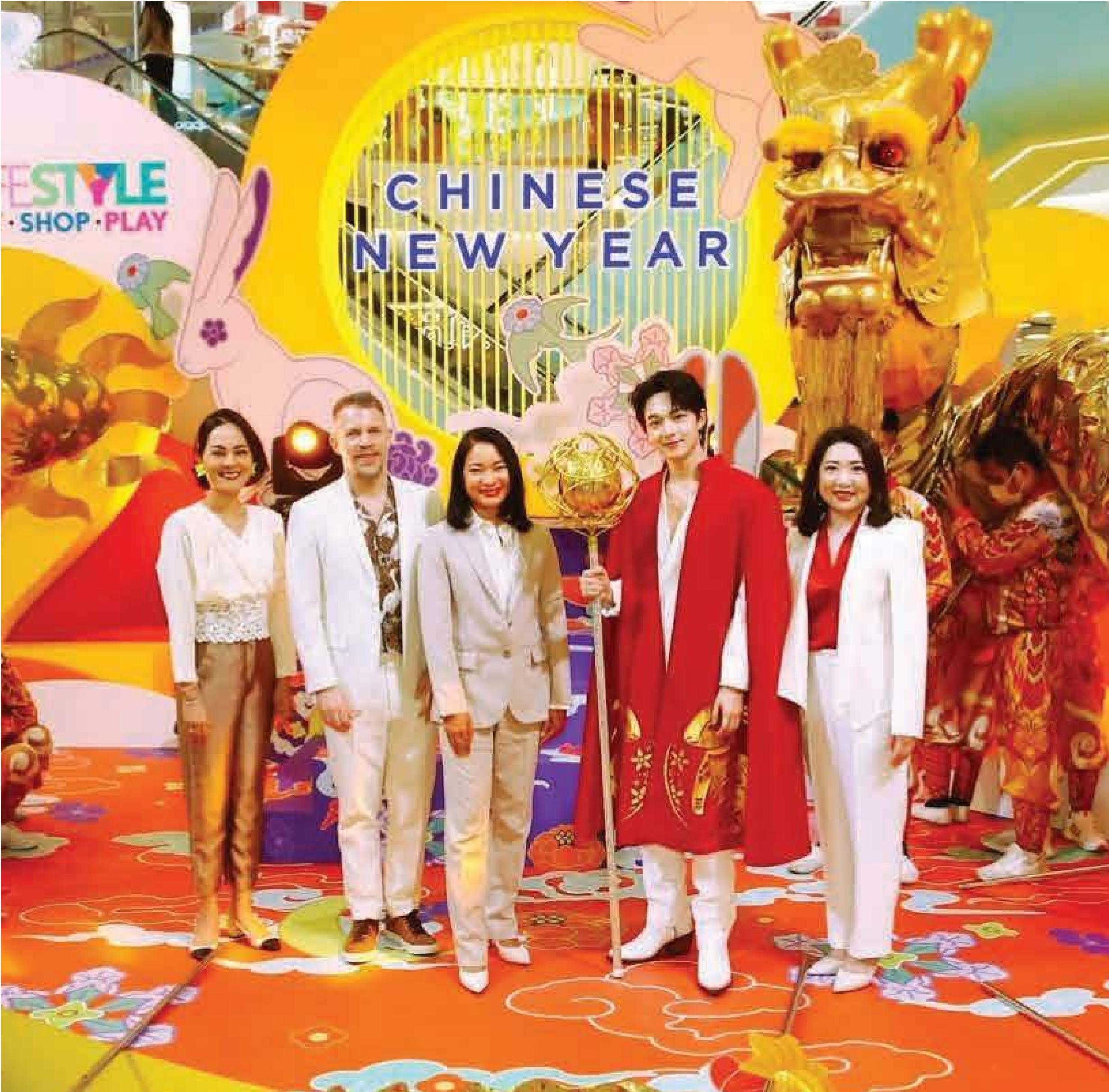
Grand Opening! New B2S store at Central Ramindra as the Center of Passionate Community & Center of Happiness