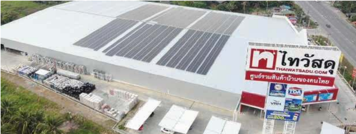
Thai Watsadu reinforces its leadership in green hardline business with Solar Rooftop installation across 23 Thai Watsadu & BnB home stores in 2023