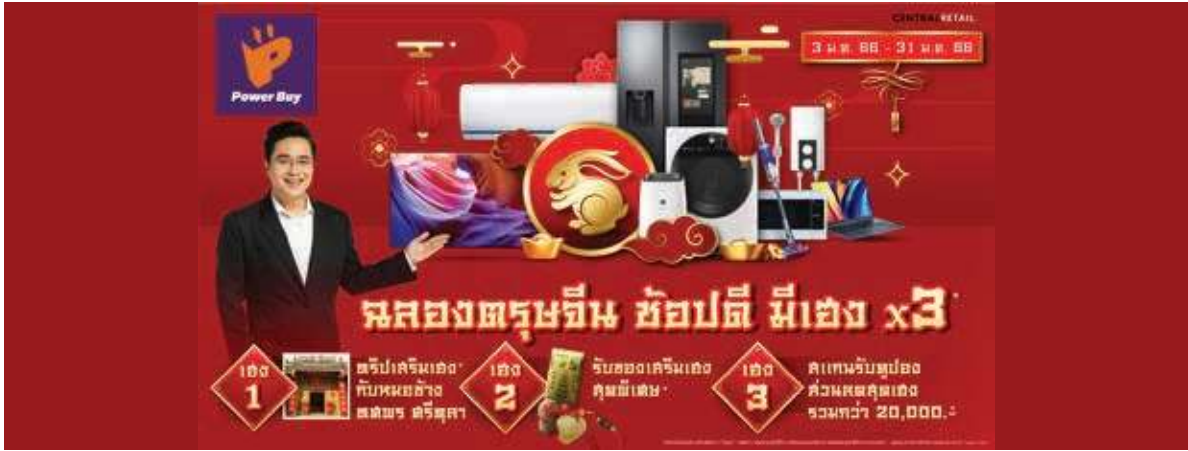
Power Buy organises “Get Triple Lucky” promotional campaign: top spenders will be joining the Good Luck Trip with Moh Chang-Tosaporn