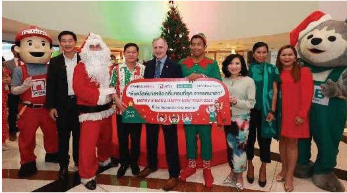
Thai Watsadu and BnB home begin a new “Fresh Chistman Pine” mission to pass on the fragrance and endless happiness