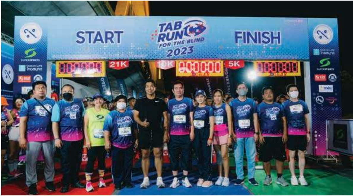
Supersports supports a better and healthier lifestyle with “TAB RUN FOR THE BLIND 2023”