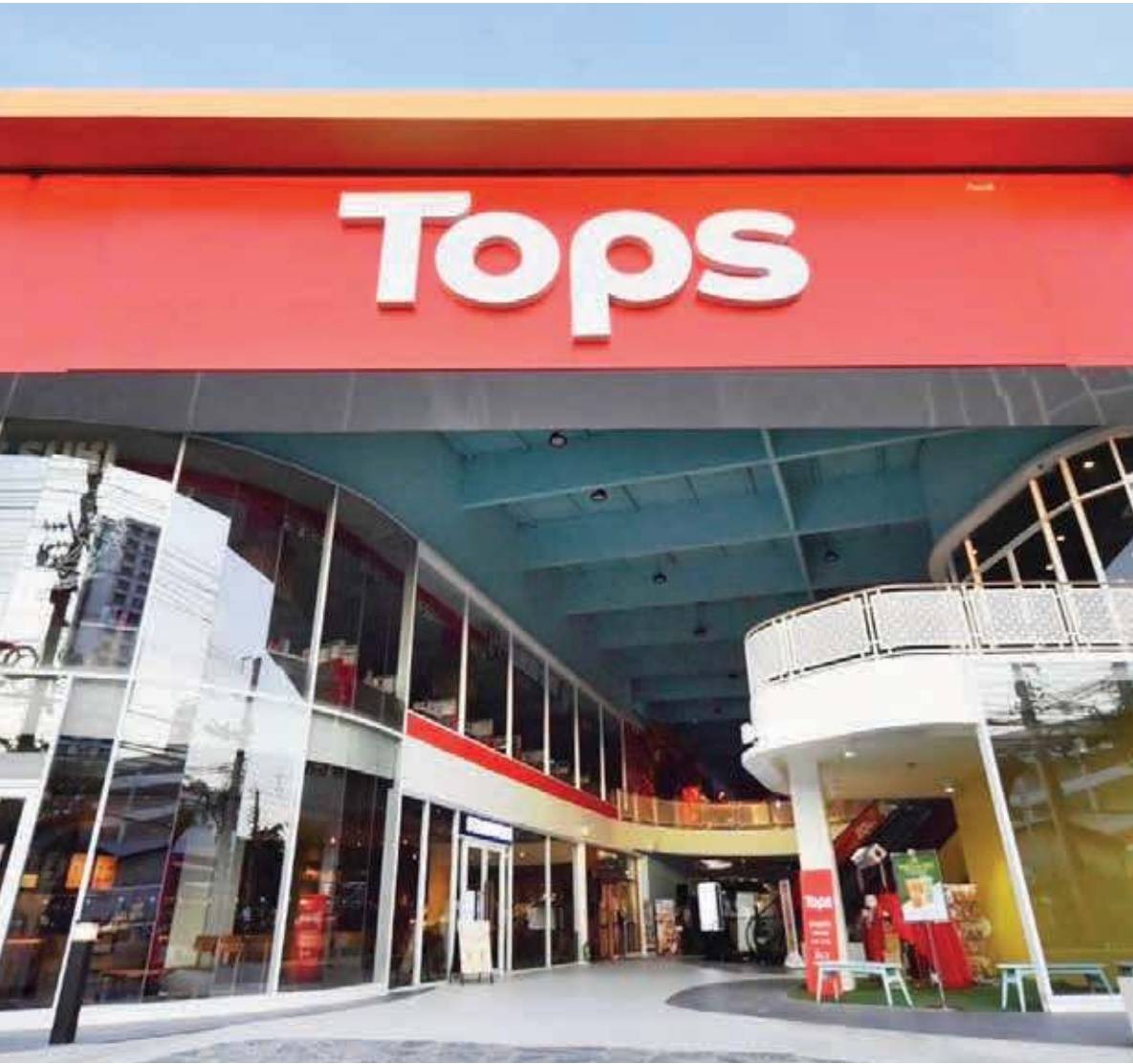
Starting the year with a grand opening! Tops introduces new Sathupradit standalone supermarket at Rama 3