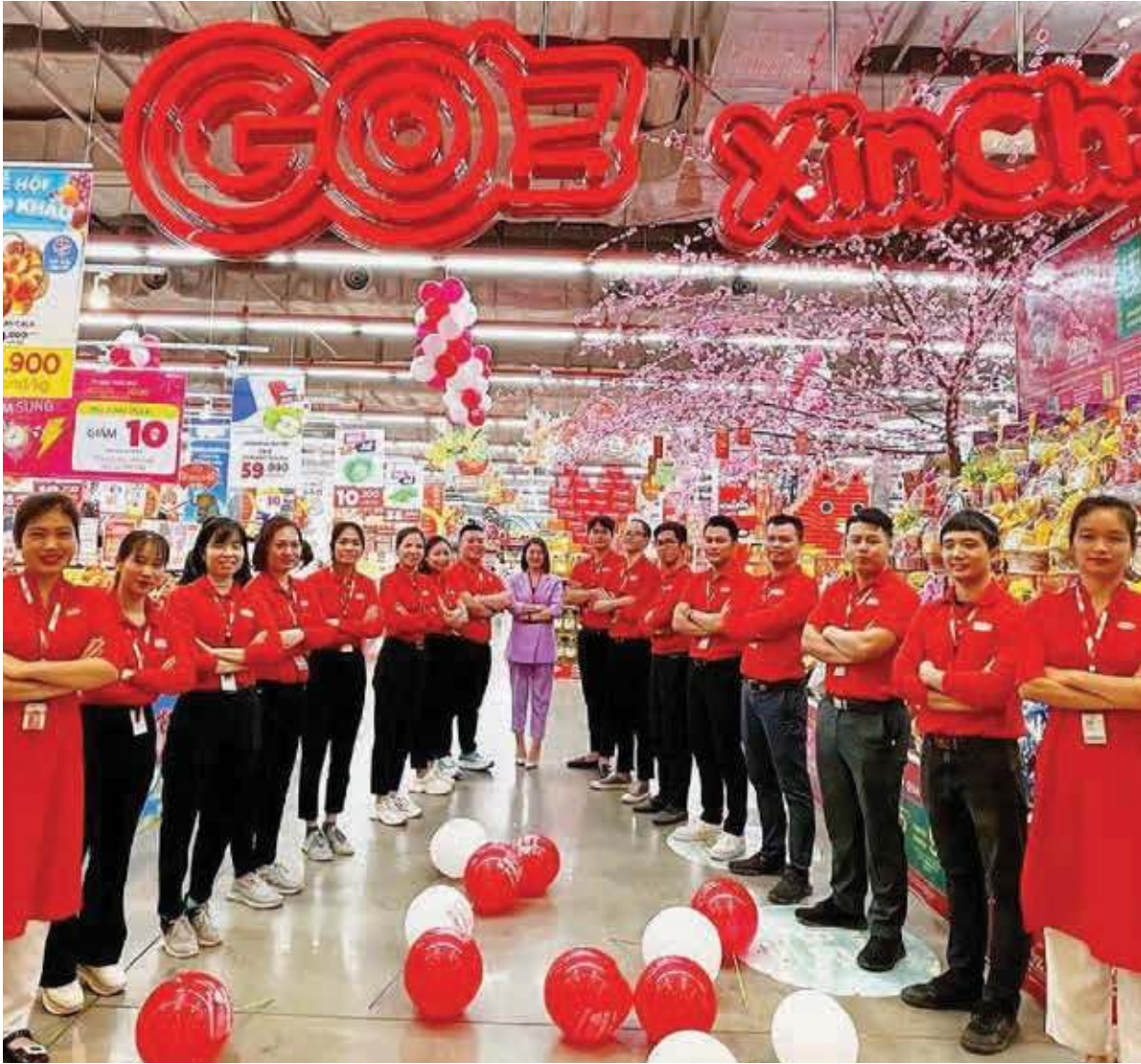
Central Retail Vietnam delightfully celebrated Tet with festive decorations at every store to welcome the joyful atmosphere