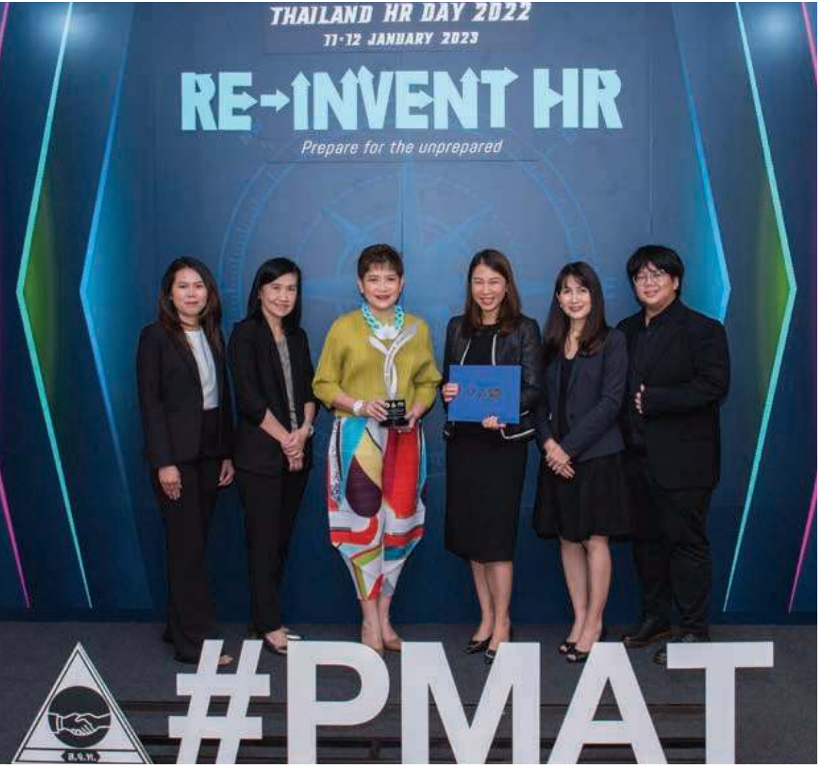
Central Retail received excellence award for HR Innovation Award 2022