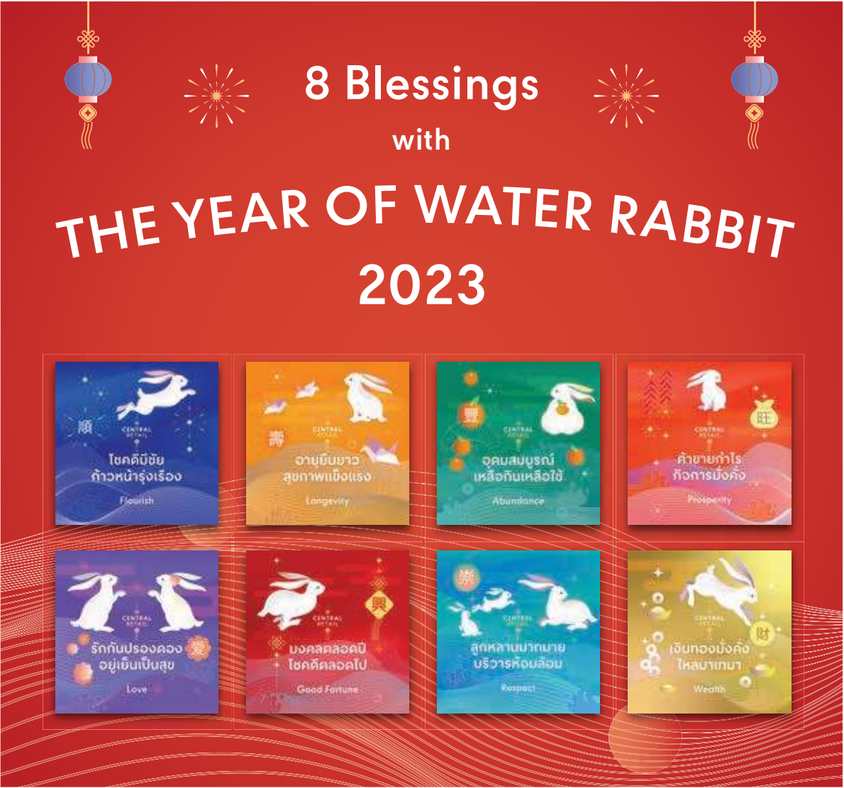
Central Retail welcomes Chinese New Year with “8 Blessings for the Year of Water Rabbit” festive E-Card greetings