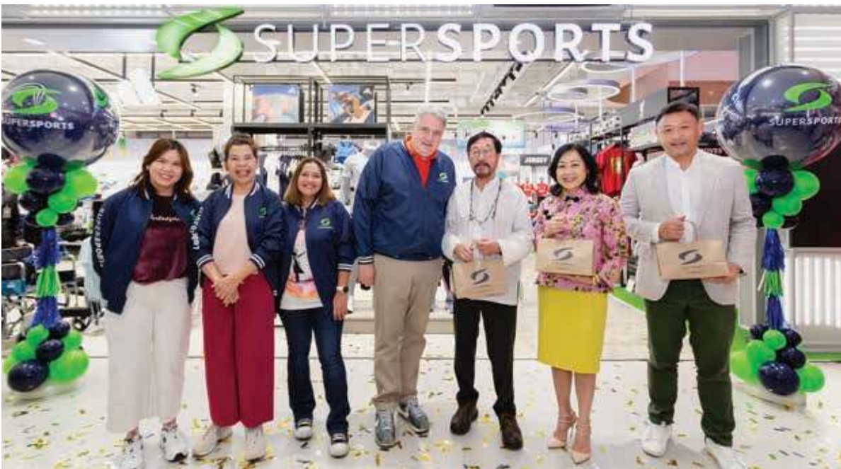
Supersports welcomes 2023 with the opening of brand-new Supersports Store at Central Ramindra