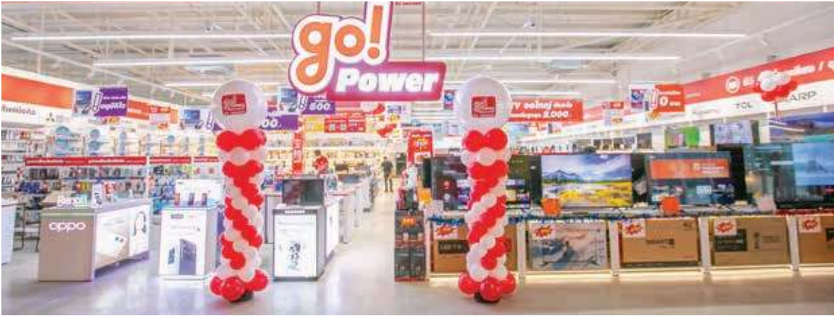
Power Buy opened three “go!Power” branches in Nakhon Si Thammarat for the locals to buy affordable, high-quality electrical appliances with installment plans