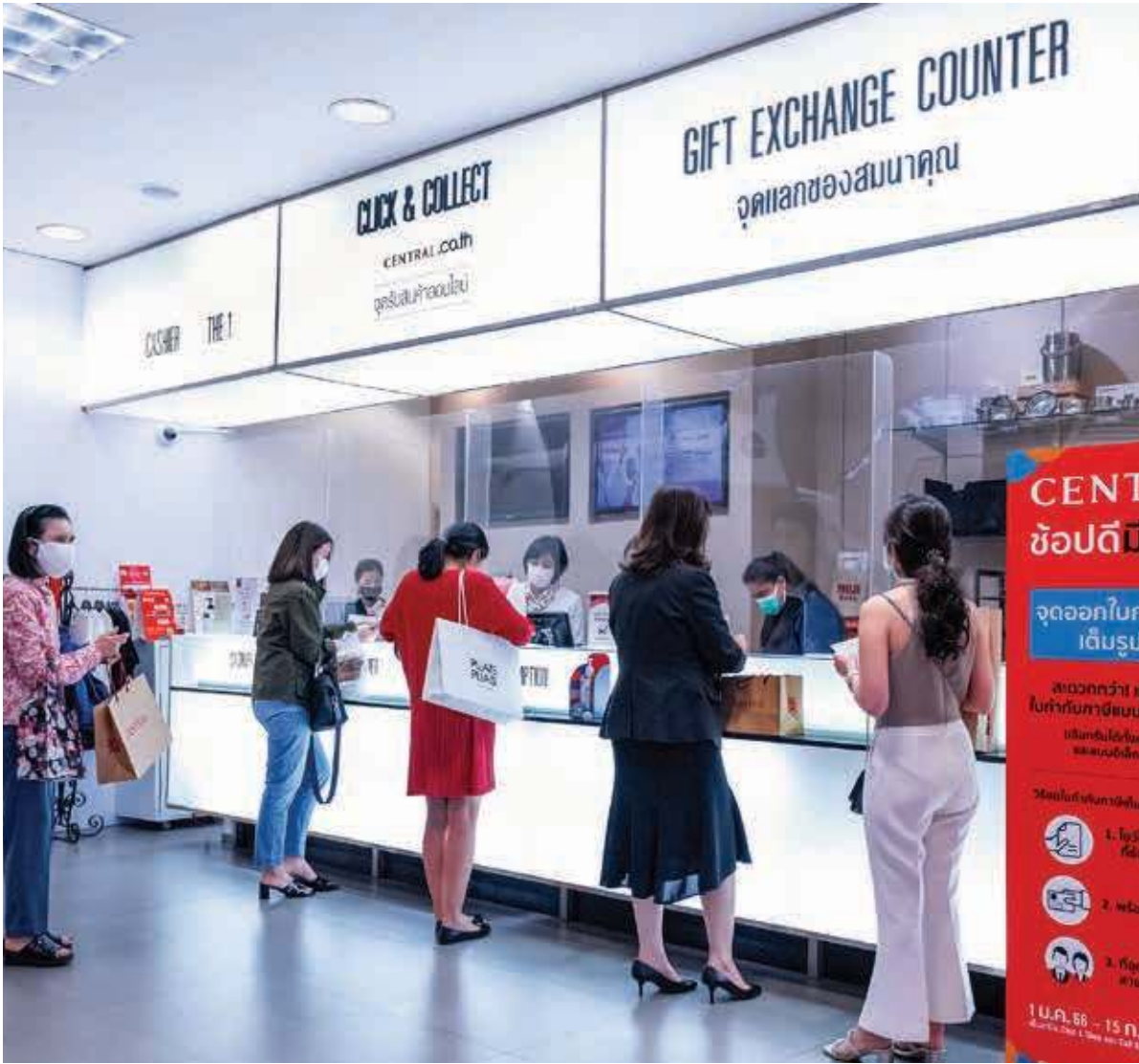
Central Retail welcomes booming “Shop Dee Mee Kuen” season with On-Top discount promotions across CRC brands