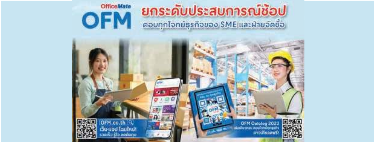
OfficeMate elevates shopping experience in 2023 with new free catalog download and new web-app launch