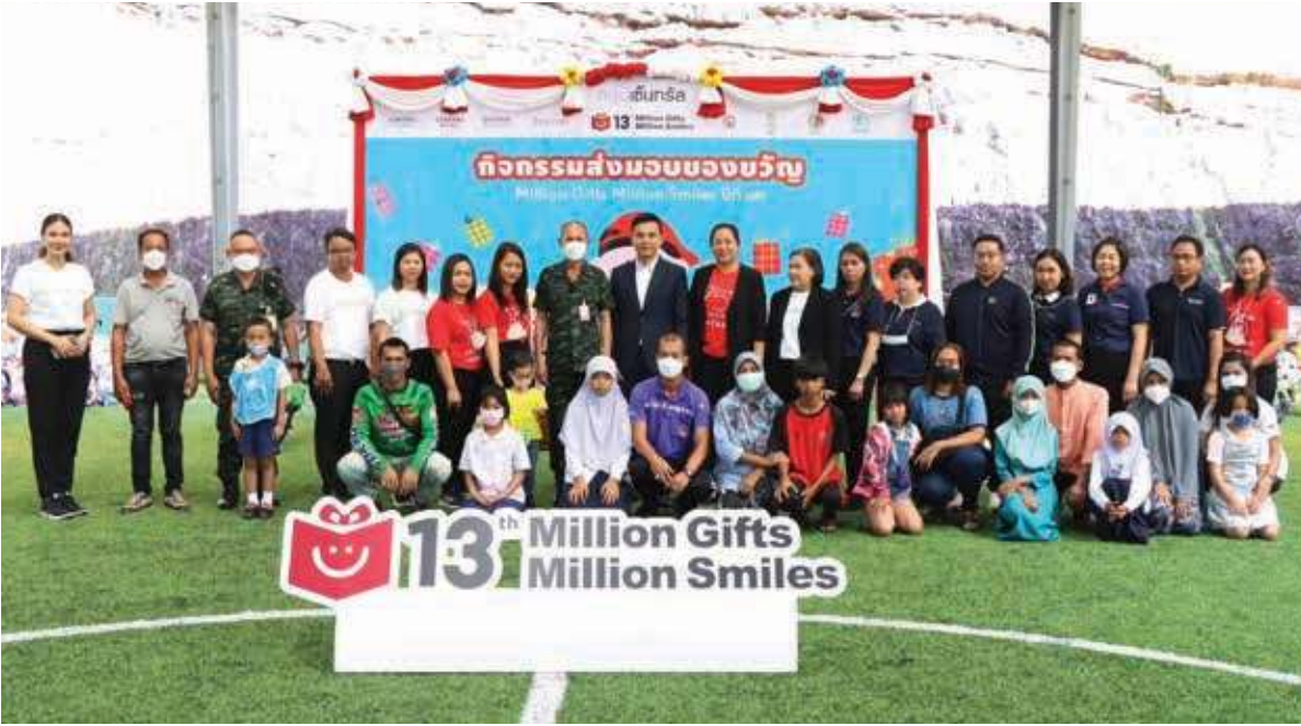
Central and Robinson share the love with children in the southern border with the 13 th “Million Gifts, Million Smiles” campaign