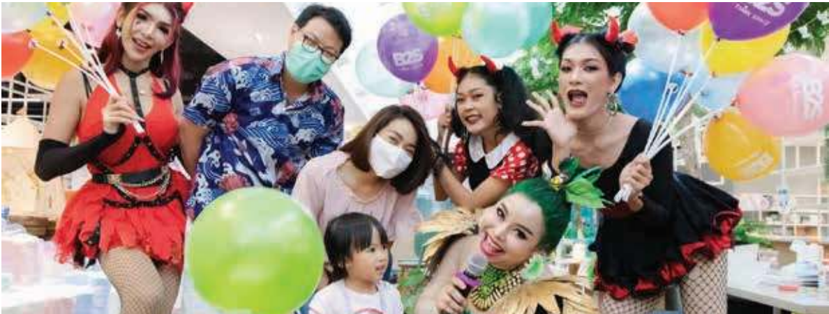
B2S “Happy Kids Happy day 2023” includes workshops and prize giveaway activities