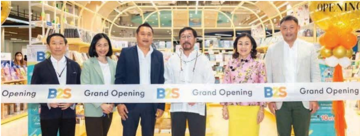
Grand Opening! New B2S store at Central Ramindra as the Center of Passionate Community & Center of Happiness