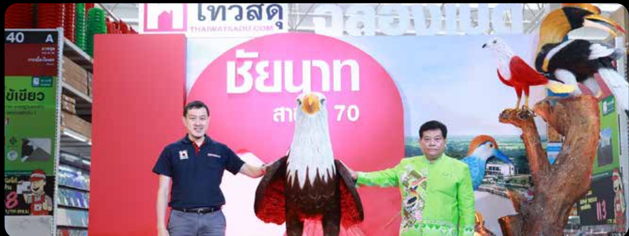
Grand opening of Thaiwatsadu's first branch in Chai Nat! Enjoy up to 60% off at our 70th branch until May 14th 2023