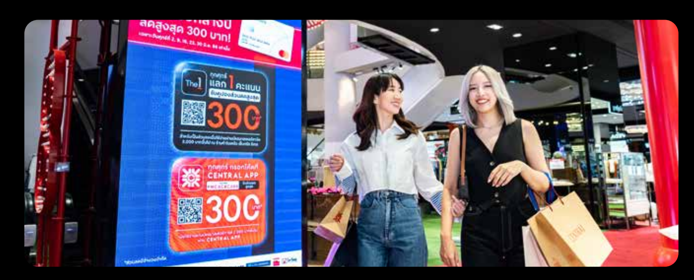
Central Retail delivers mid-year sale promotion with maximum THB 300 discount via "Friday Pay with Mastercard" campaign every Friday both in-store and via Application

Central Retail achieves robust growth in Q1 with a revenue of THB 63,206 million (+12%) and a profit of THB 2,312 million (+75%)