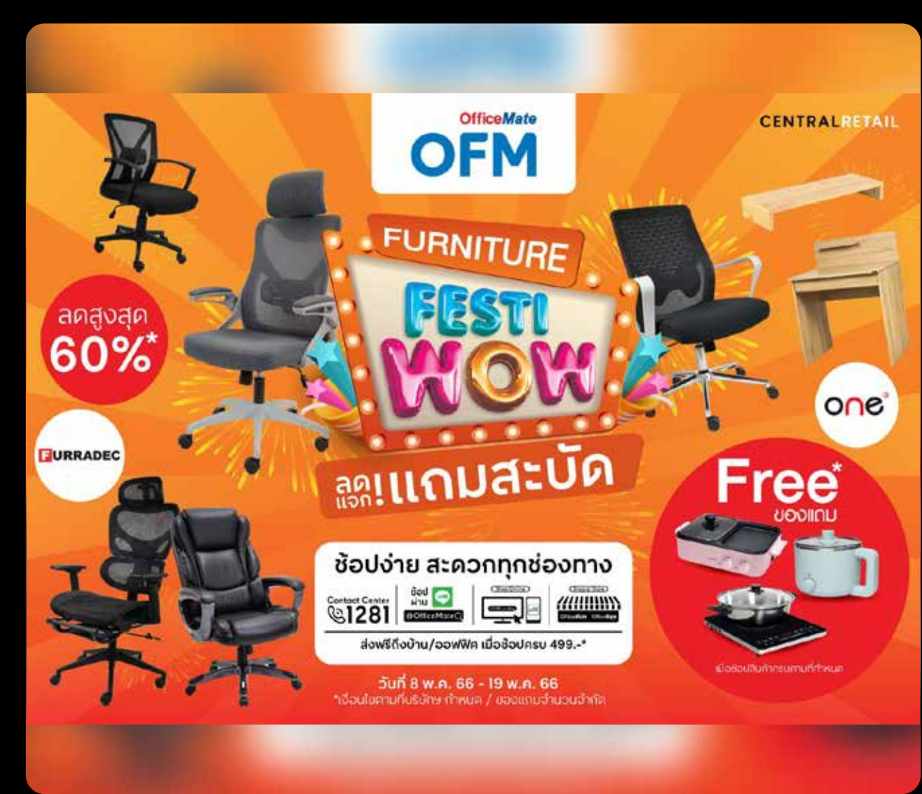
OfficeMate organises the campaign "Furniture FestiWow" offering discount and free delivery & assembly service