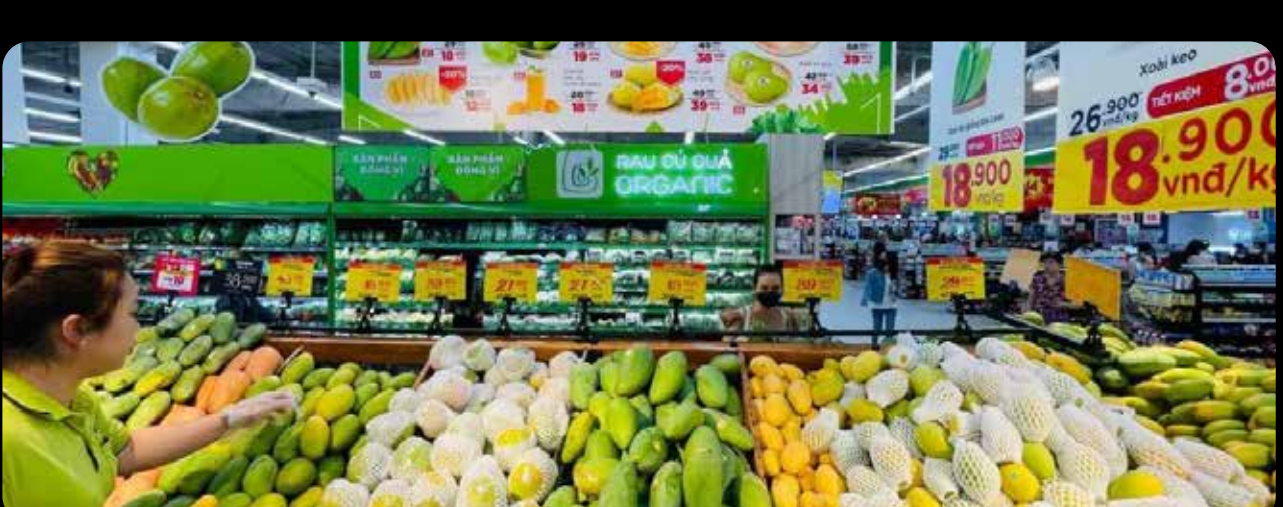
Central Retail Vietnam organised "Dong Thap Mango Week", with hot promotions throughout 48 retail stores