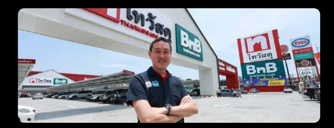
Thaiwatsadu takes over upper Bangkok, expanding its 71st branch "Thaiwatsadu x BnB home Muang Ake"

Thaiwatsadu offers over 1 MB prize for "Thaiwatsadu X Fairtex 4 Champions Tournament"