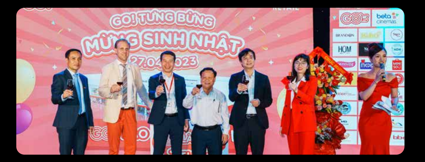
Central Retail Vietnam celebrates the first anniversary of GO! Mall and GO! Hypermarket in Lao Cai province