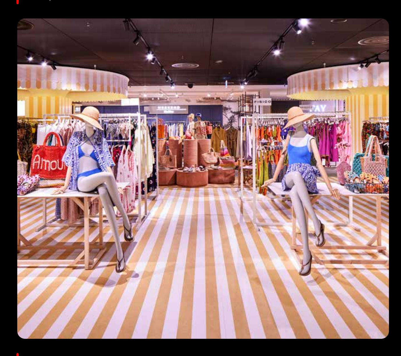
Rinascente welcomes the holidays season with beachwear selection, serving colourful summer fashion from exclusive brands