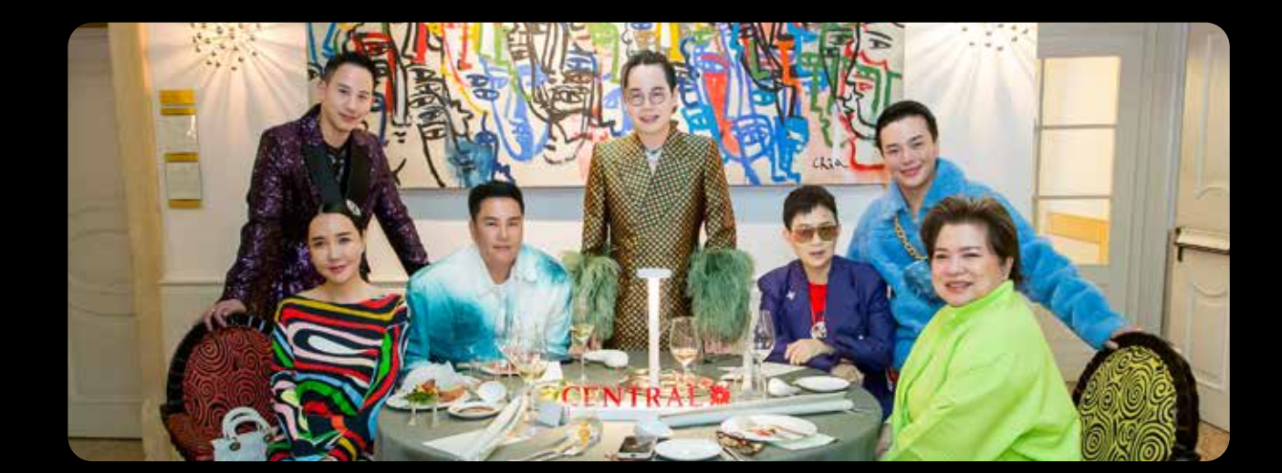
Central arranged a special Italy trip for VVIC to enjoy Italian culture and exclusive shopping experiences at La Rinascente

Central & Robinson, Thailand's kitchenware and home destination, present "CENTRAL COOKING TIME 2023" & "ROBINSON COOKING FAIR 2023"