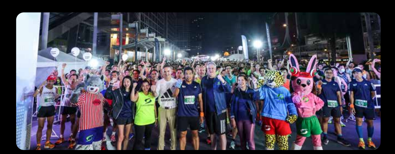
Supersports "10 Miles Run 2023 Thailand presented by Adidas" returned to revive the passion and spirit of over 8,000 runners in Bangkok