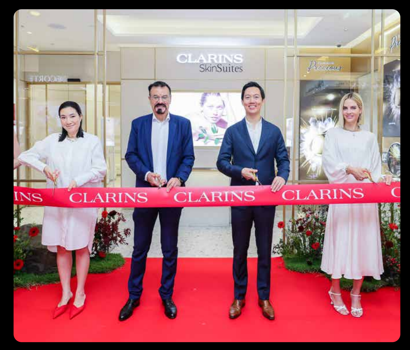
CMG held a grand opening ceremony of new Clarins SkinSuites at Central Chidlom