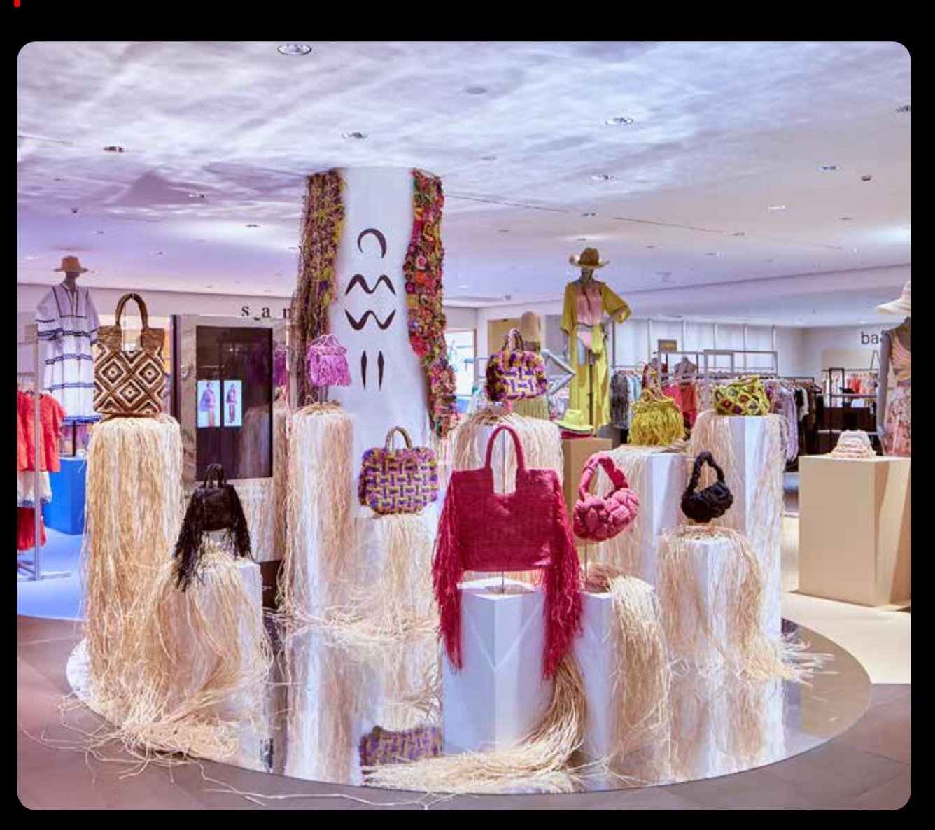
Rinascente spiced up leisure time fashionably with the "Vacation Setup", offering elements and shades of the bright and bold looks at Milan store