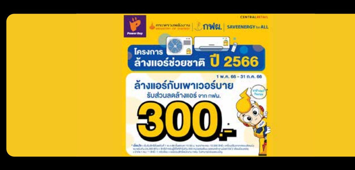
Power Buy and EGAT continue the "Clean your air, Care your life" project, offering THB 300 discount on air conditioner cleaning