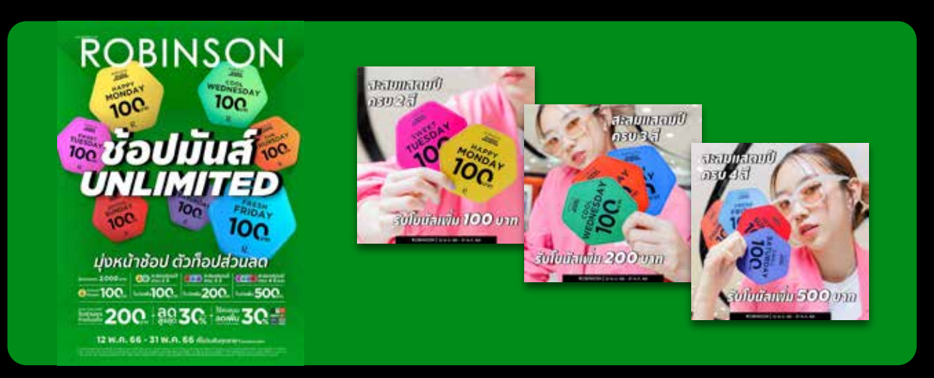
Robinson invites to shop with "Robinson Shop Mun Unlimited", offering big discounts, discount stamps, and more