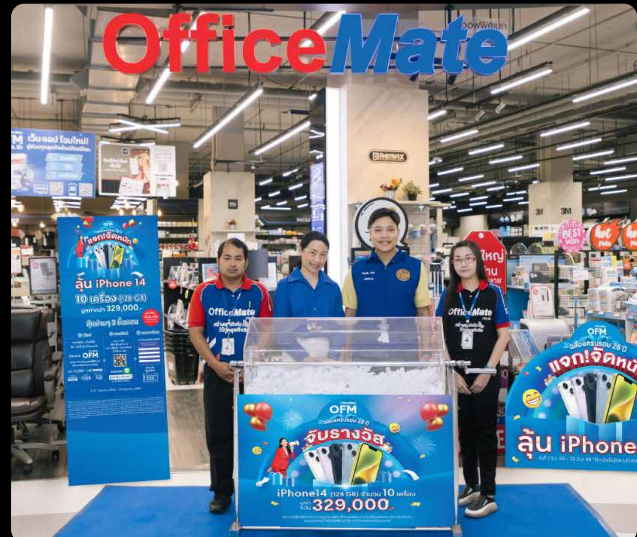
OfficeMate's Grand Giveaway! Win prizes, including 10 iPhone 14 (128GB), total value of THB 329,000