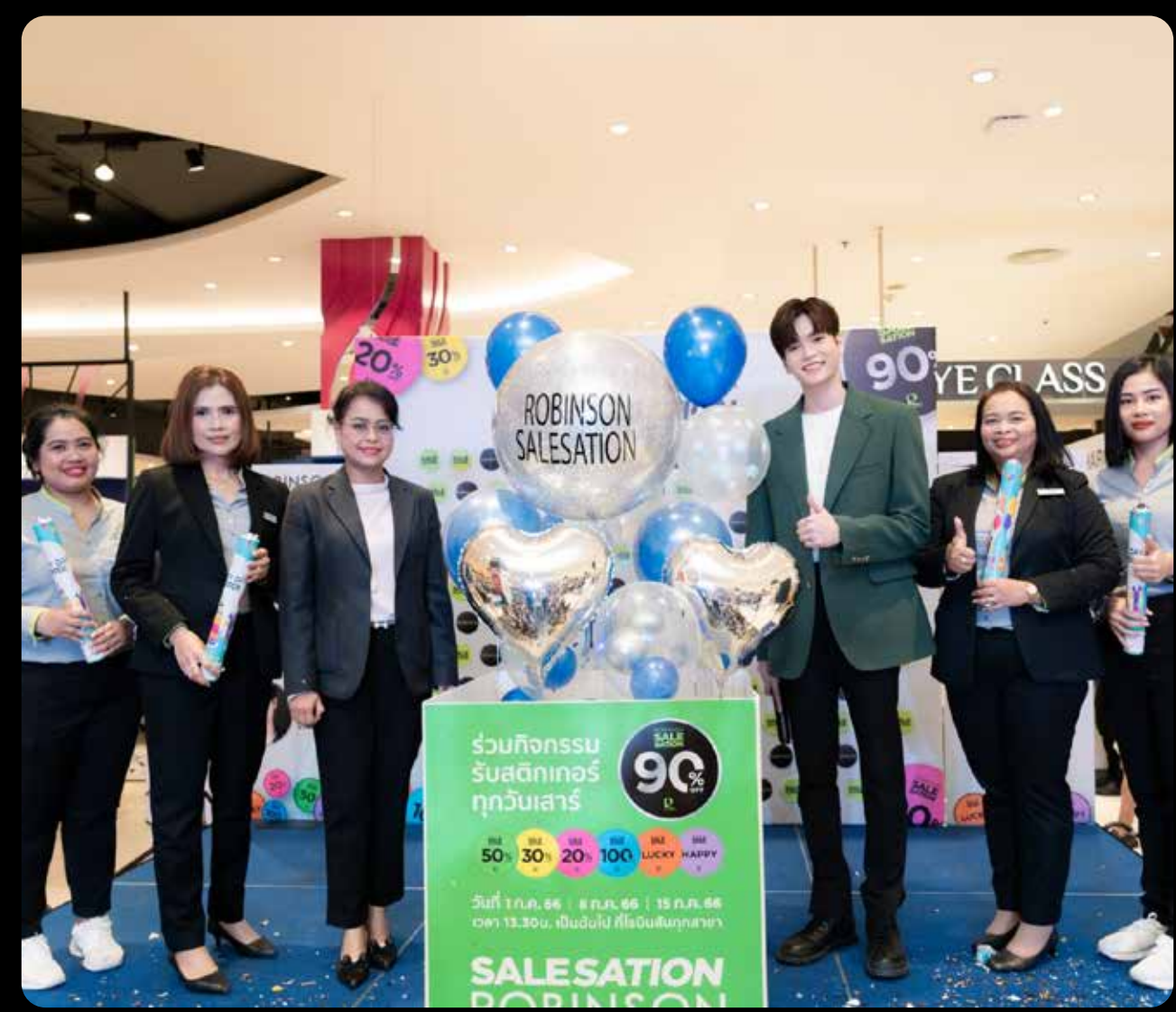
Robinson presents "ROBINSON SALESATION #2: Discounts for What You Love Most!" including discount stamps, plentiful cashback rewards and jaw-dropping 90% discount stickers